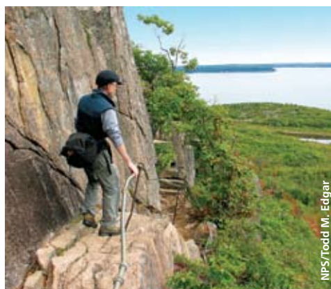
The challenging Precipice Trail is not for the faint-of-heart.