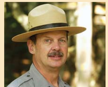
Superintendent Sheridan Steele.

It is hard to imagine an Acadia without birds and beavers, but imagine what Acadia might look like 20 years from now if today’s youth remain uninspired to protect it. If young people spend 6 hours a day on cell phones and computers, national parks and the outdoors seem to be increasingly irrelevant. You and your family have a wonderful opportunity to enjoy Acadia today—and to help us inspire the next generation of stewards.