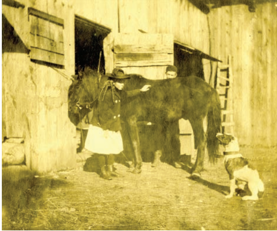
Figure 6. Cora Weir and Willie Remy, WEFA 16389.