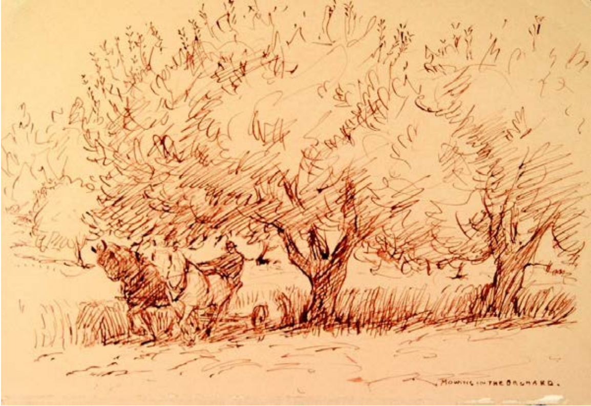
Figure 36. Mahonri M. Young, Mowing in the Orchard , ink, 10 \frac{3}{16} \times 7 \frac{1}{16} in.

Brigham Young University Museum of Art, purchase/gift of Mahonri M. Young Estate, 1959.