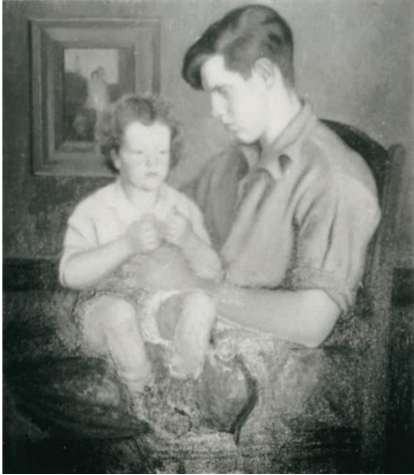
Figure 46. Dorothy Weir Young, Untitled, From Bass Family Photograph Collection.