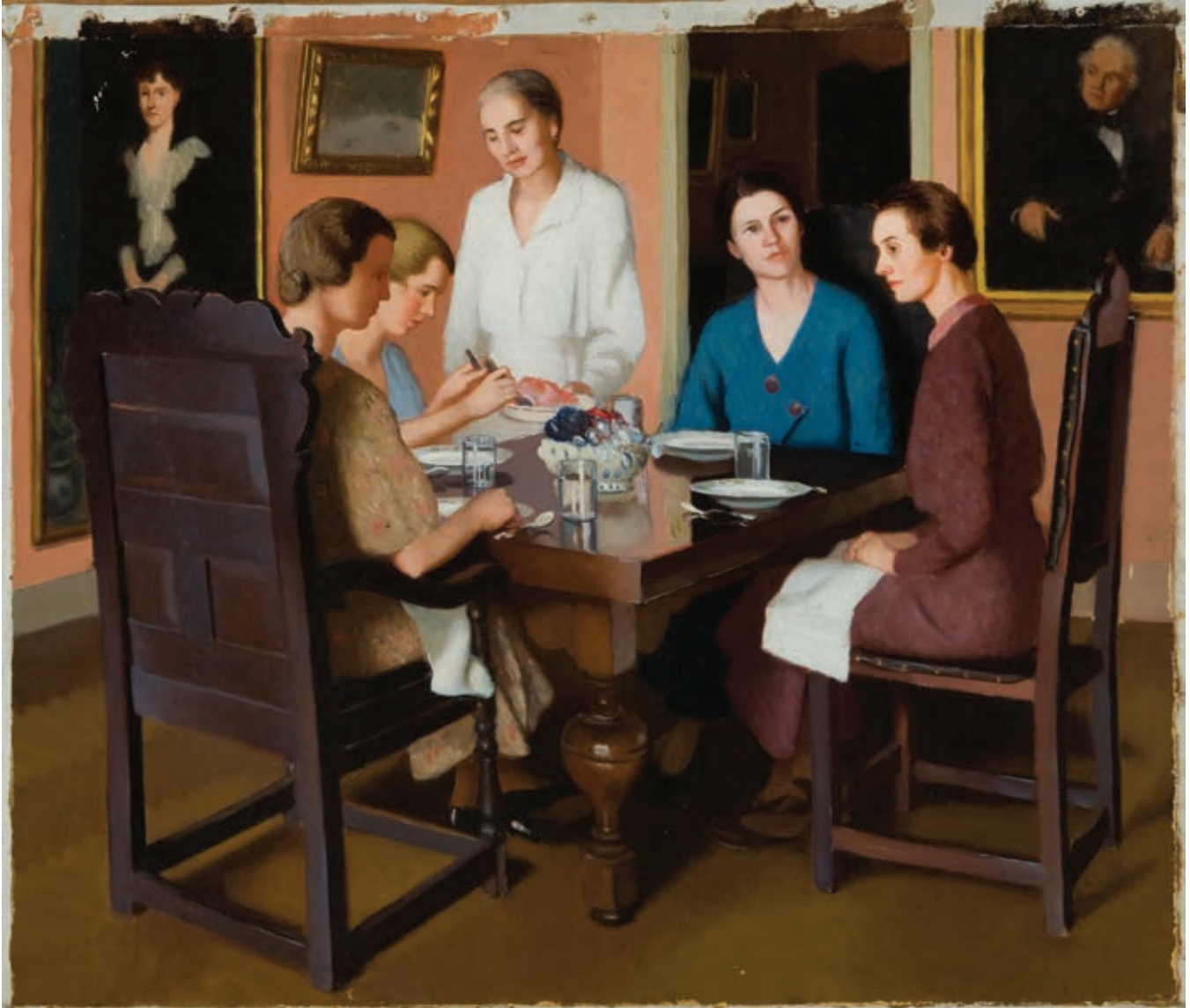
Figure 26. Dorothy Weir Young, Ladies at Dinner , c.1930, oil on canvas on board, 25 × 30 in. Brigham Young University Museum of Art, purchase/gift of Mahonri M. Young Estate, 1959.