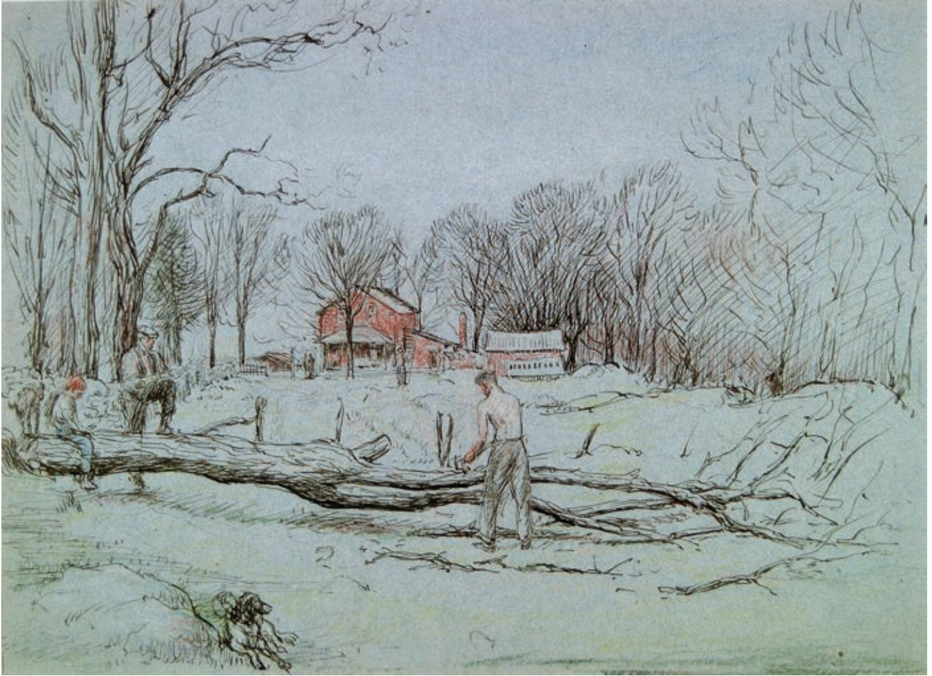
Figure 43. Mahonri M. Young, Cutting Tree at Branchville , 20th century, ink and pastel, 19 × 13 ¾ in. Brigham Young University Museum of Art, purchase/gift of Mahonri M. Young Estate, 1959.