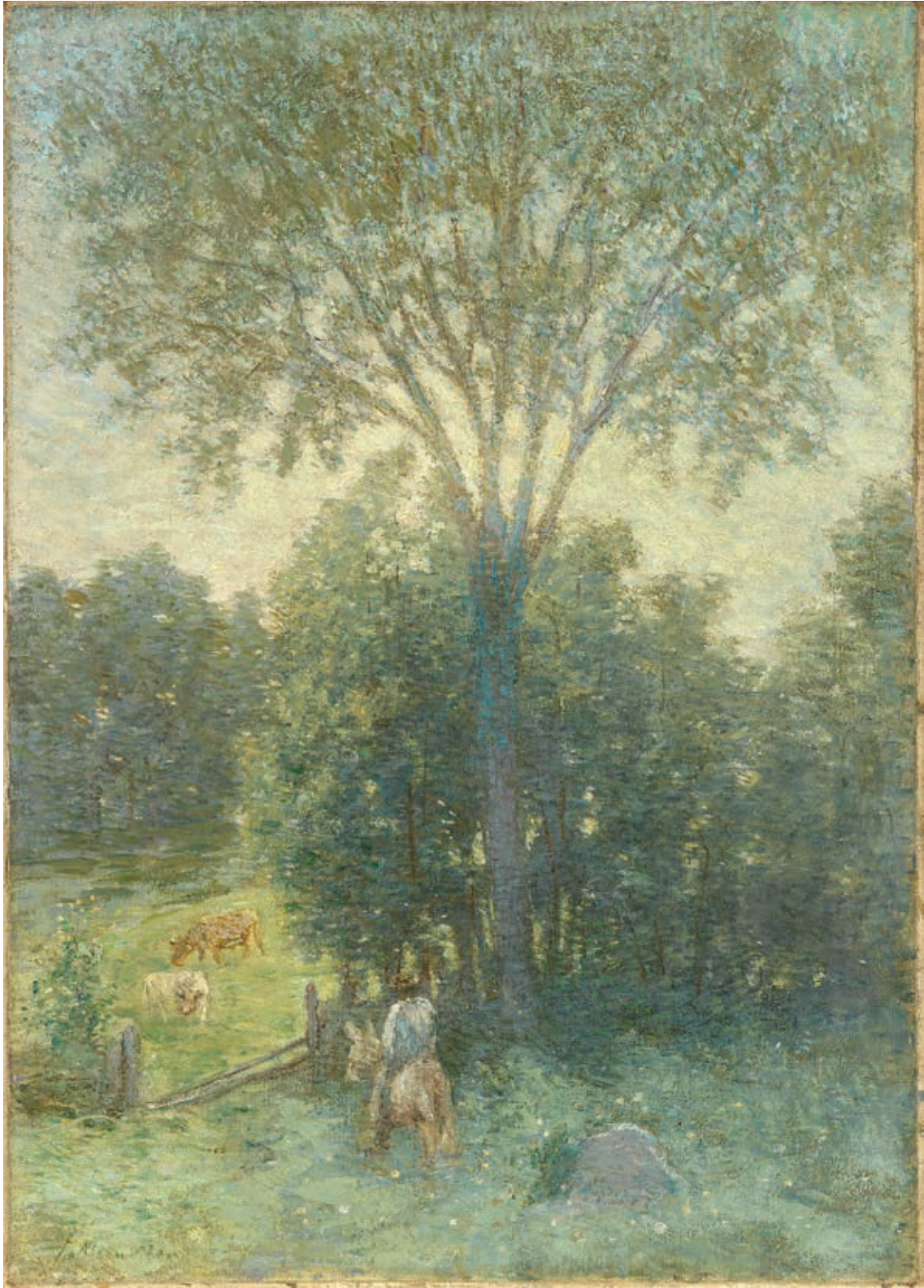
Figure 8. Julian Alden Weir, Driving the Cows Home (original title: Haunt of the Woodcock ).

Oil on canvas, 34 \frac{1}{4} \times 24 \frac{5}{16} in.