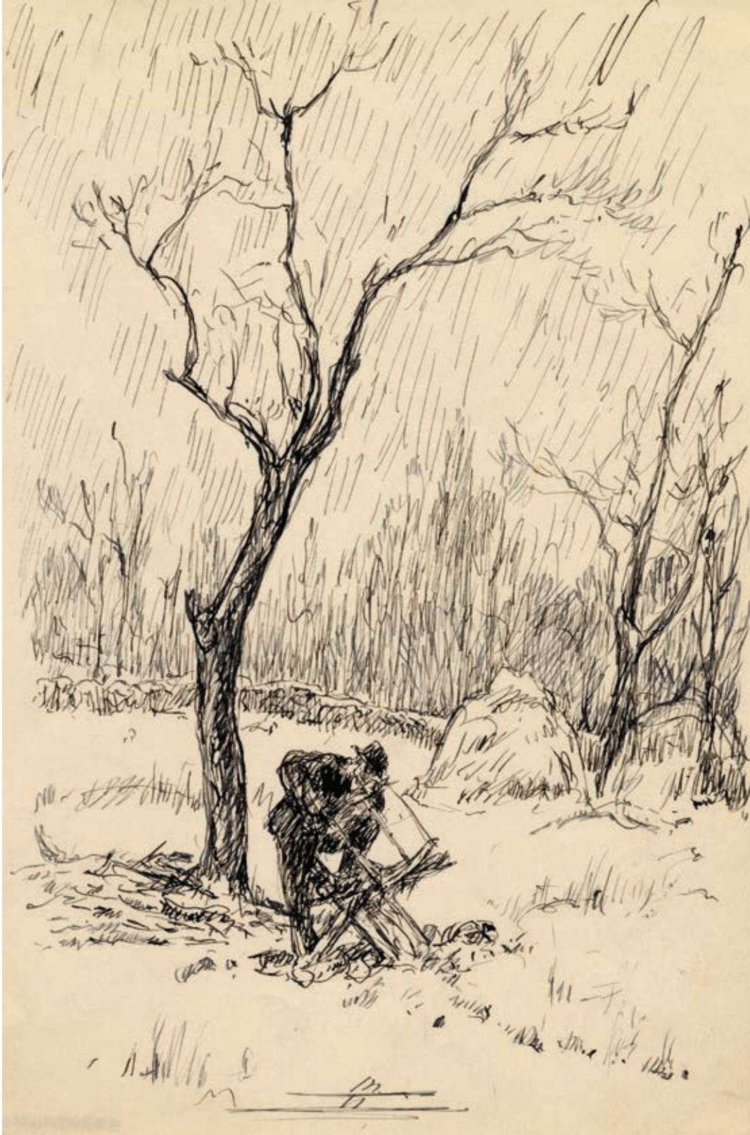
Figure 44. Mahonri M. Young, Man Sawing with a Woodsaw , ink, 8 \frac{3}{16} \times 5 \frac{1}{2} in.

Brigham Young University Museum of Art, purchase/gift of Mahonri M. Young Estate, 1959.