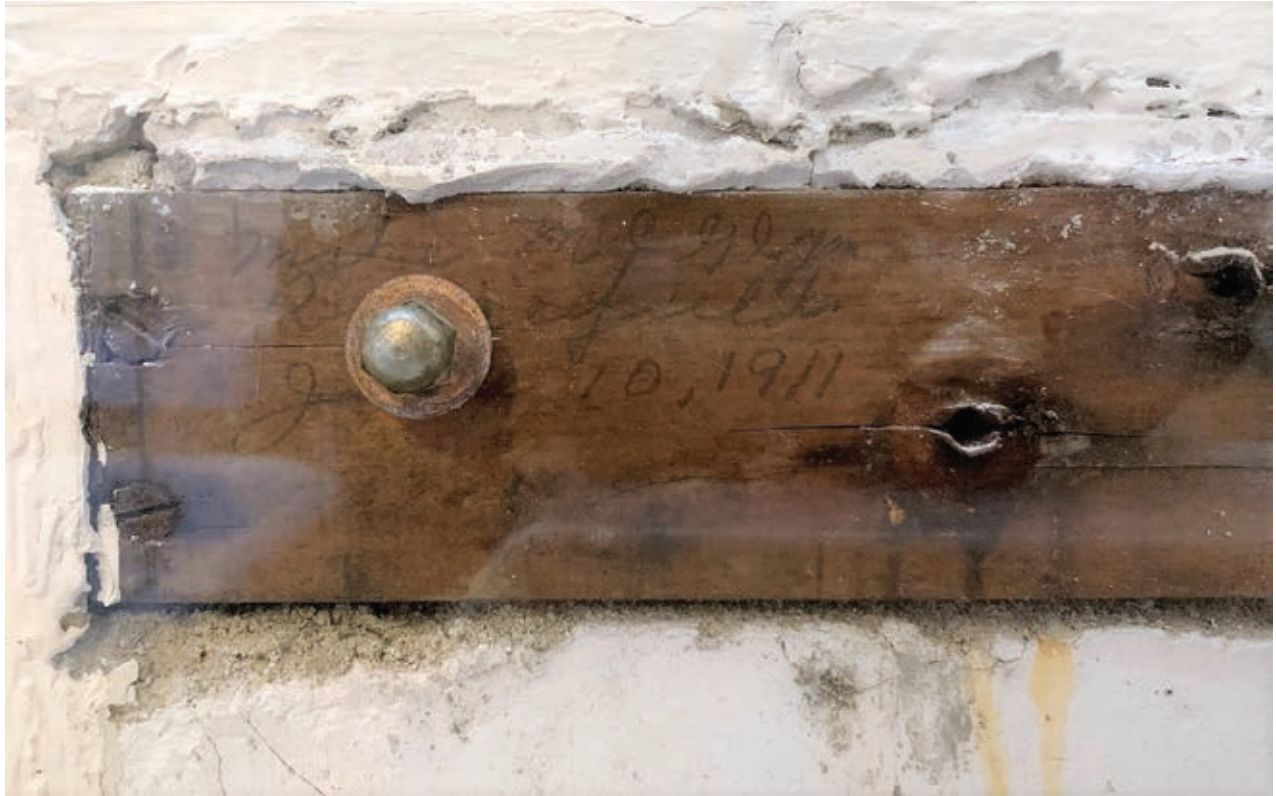
Figure 2. Mike McGlynn's signature behind toilet, dated June 10, 1911. Photograph by author, November 13, 2019.