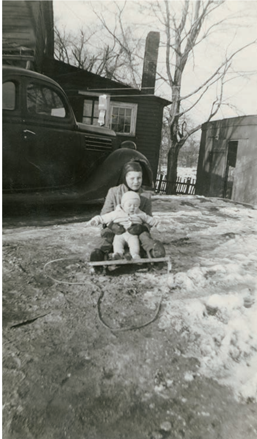
Figure 50. Kenneth and Ronnie Bass on sled, 1942, Bass Family Photograph Collection, HP 01028.