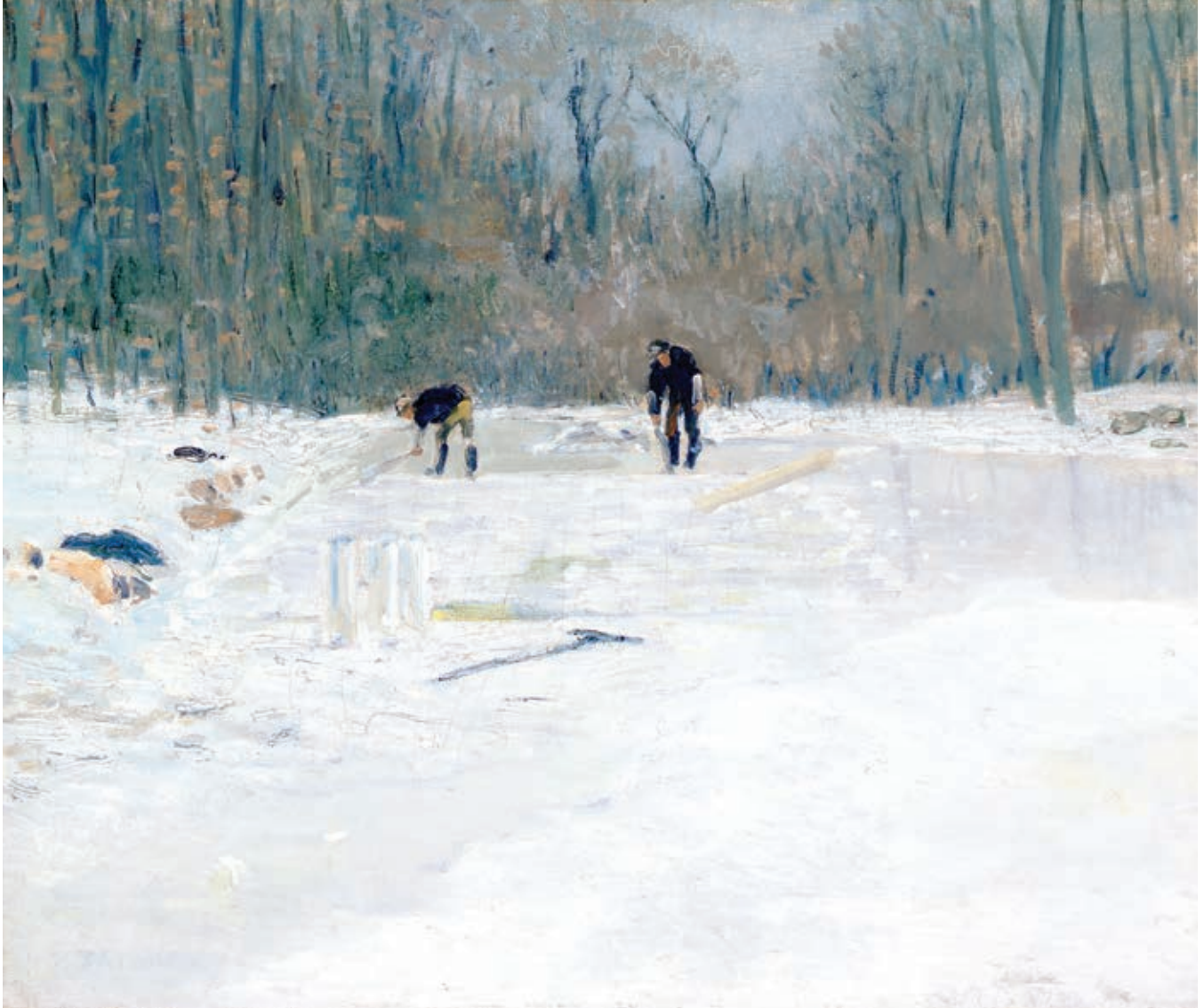
Figure 13. Julian Alden Weir, The Ice Cutters , 1895.

Oil on canvas, 19 \frac{3}{4} in \times 23 \frac{3}{4} in.