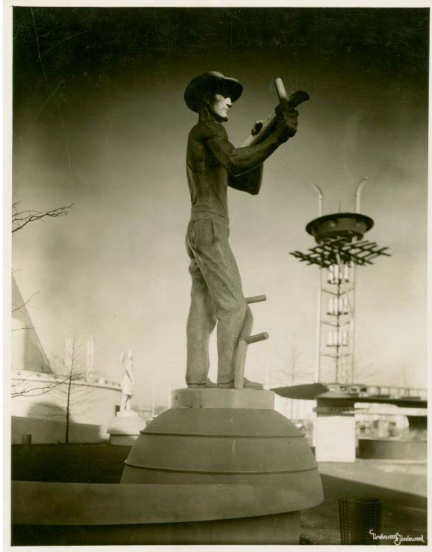
Figure 49. Manuscripts and Archives Division, The New York Public Library, “Art—Sculpture—Agriculture (Mahonri Young),” New York Public Library Digital Collections. Accessed August 8, 2021. https://digitalcollections.nypl.org/items/5e66b3e8-a838-d471-e040-e00a180654d7 .