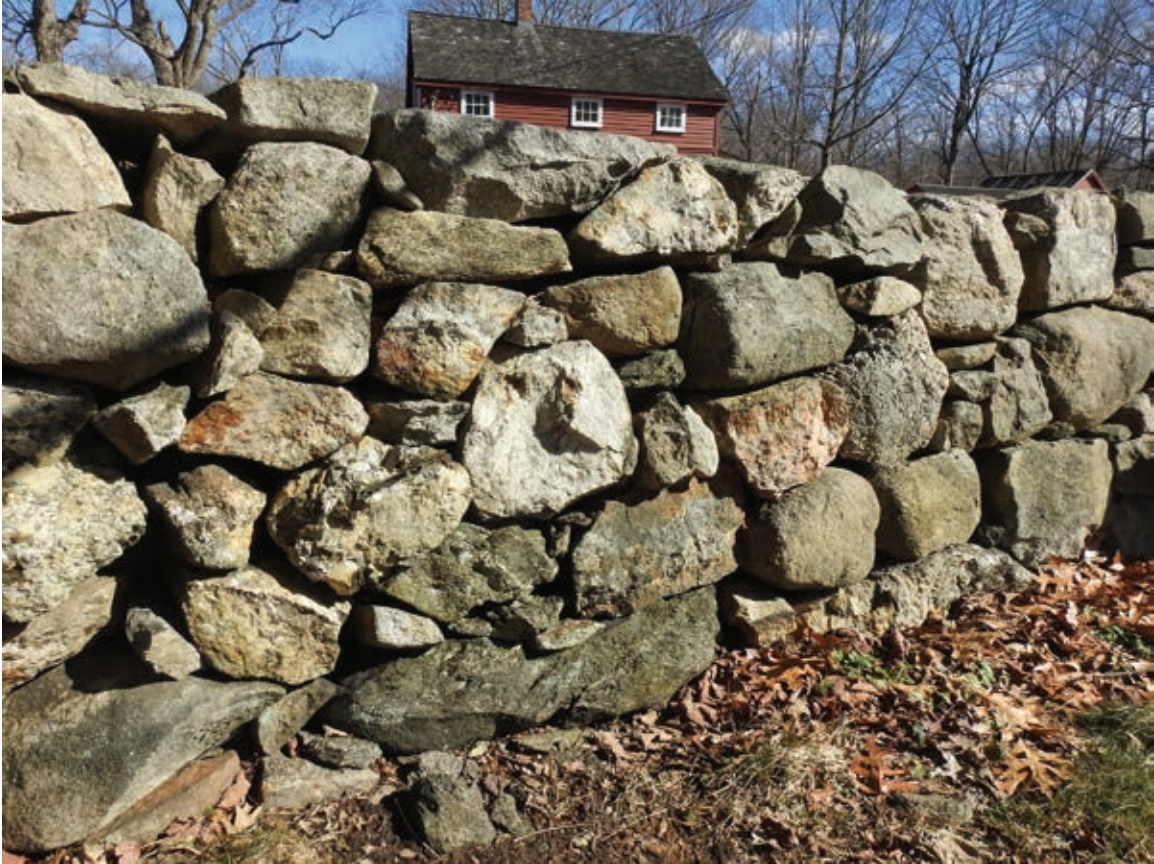
Figure 54. Great Wall of Cora Detail, NPS Photo / A. Thibault.