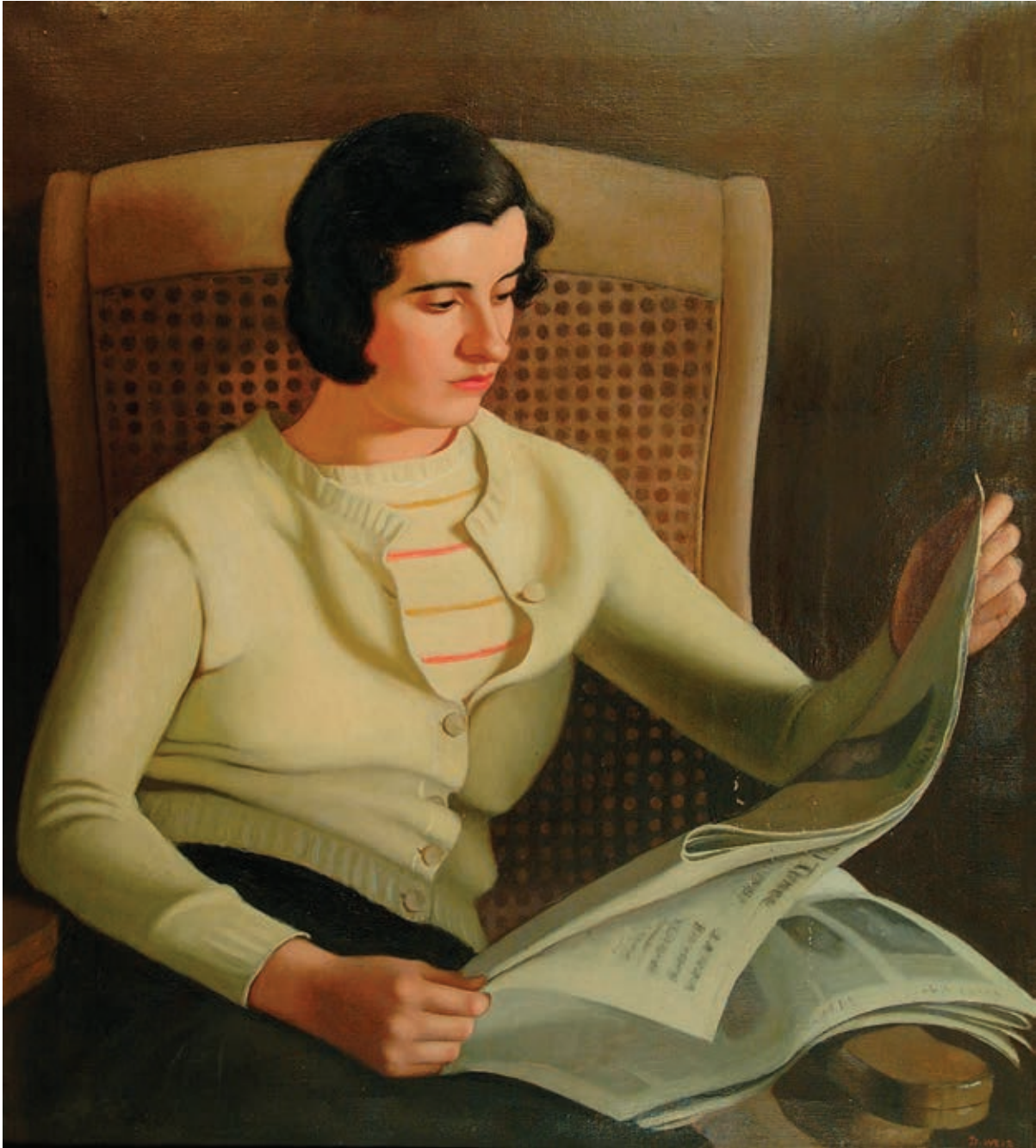
Figure 47. Dorothy Weir Young, Seated Girl Reading Newspaper , c. 1930, oil on canvas, 29 15 / 16 × 27 in. Brigham Young University Museum of Art, purchase/gift of Mahonri M. Young Estate, 1959.