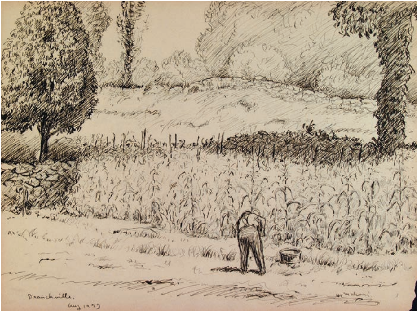
Figure 35. Mahonri M. Young, Branchville August 1939 , ink, 1939, 10 ¼ × 13 ¾ in. Brigham Young University Museum of Art, purchase/gift of Mahonri M. Young Estate, 1959.