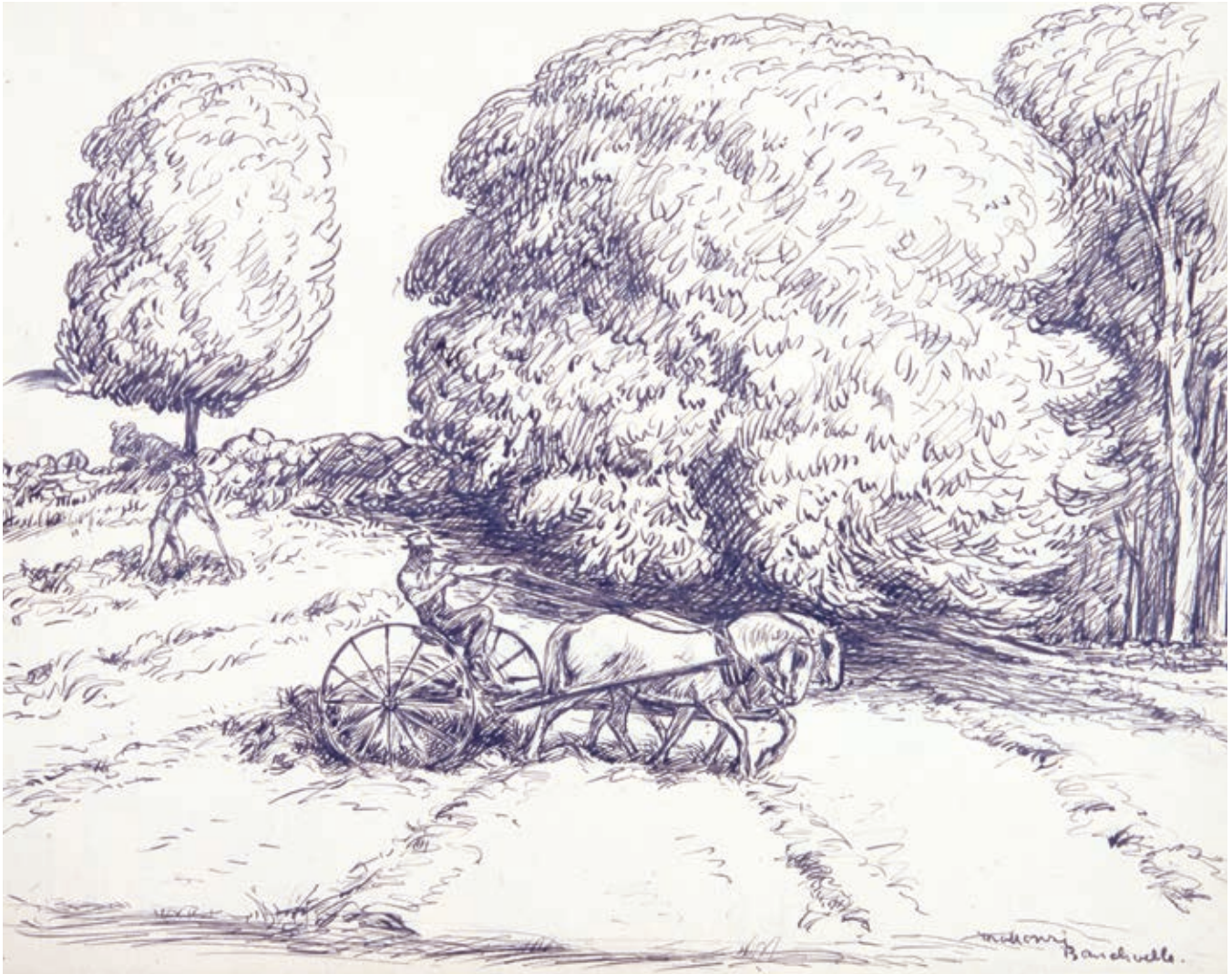
Figure 39. Mahonri M. Young, Mowing at Branchville , ink, 9 \frac{3}{16} \times 12 \frac{1}{8} in.

Brigham Young University Museum of Art, purchase/gift of Mahonri M. Young Estate, 1959.