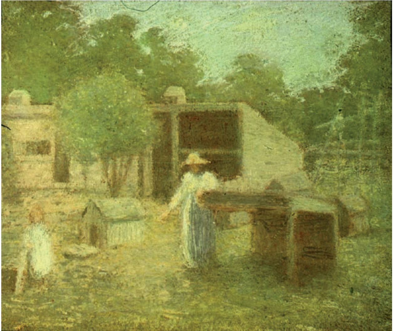
Figure 9. Julian Alden Weir, Feeding the Chickens at Branchville , pastel on paper mounted on canvas, early 1890s, 20 \frac{1}{8} \times 24 \frac{1}{4} in. The William B. Carlin Trust.