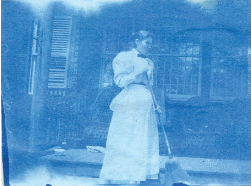
Figure 20. Unidentified Domestic Staff, WEFA 16388.