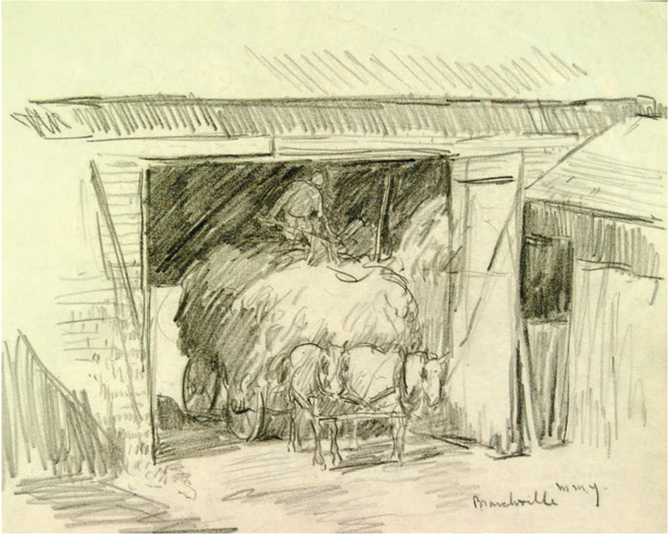
Figure 40. Mahonri M. Young, Haywagon in Barn , graphite, 8 \frac{1}{16} \times 10 \frac{3}{16} in. Brigham Young University Museum of Art, purchase/gift of Mahonri M. Young Estate, 1959.