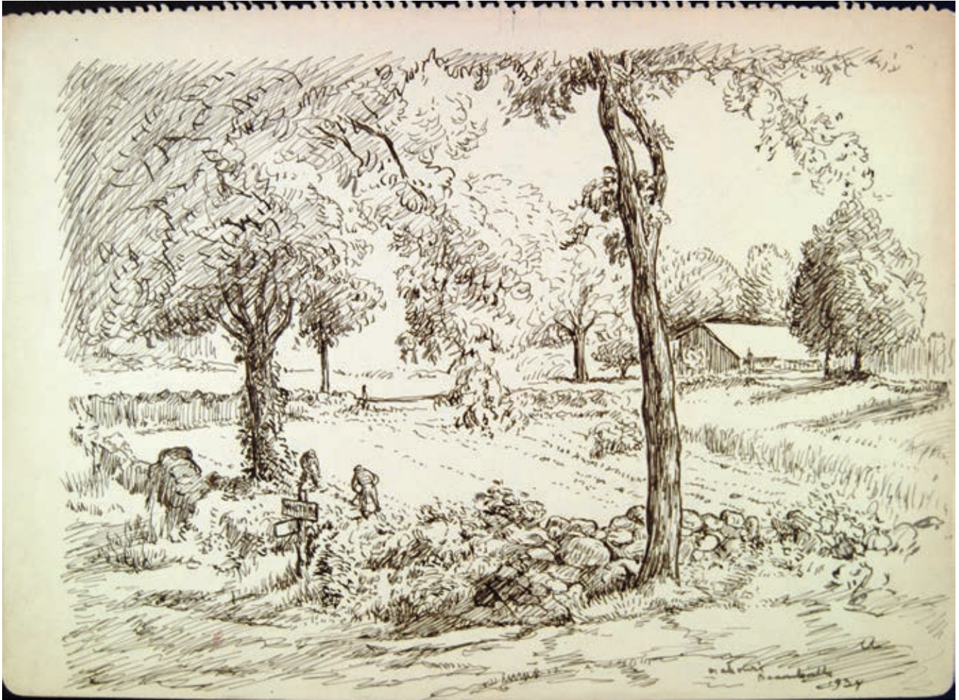
Figure 45. Mahonri M. Young, Branchville Garden , 1934, ink, 9 5 / 8 × 13 1 / 2 in.

Brigham Young University Museum of Art, purchase/gift of Mahonri M. Young Estate, 1959.