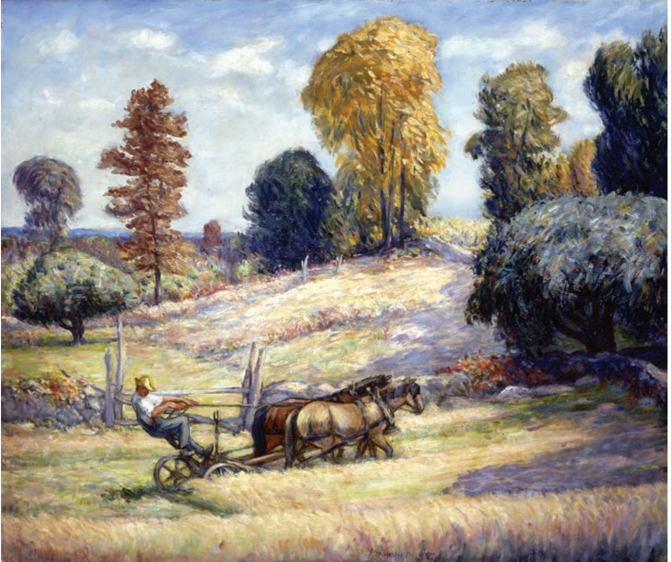
Figure 37. Mahonri M. Young, Rowen , 1937, oil on canvas, 25 ¼ × 30 ⅙ in.

Brigham Young University Museum of Art, purchase/gift of the Mahonri M. Young Estate, 1959.