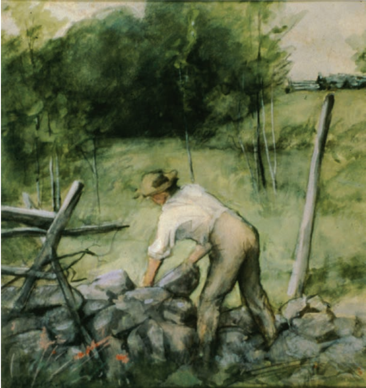
Figure 3. Julian Alden Weir, Mending the Stone Wall , pencil, watercolor and gouache on paper, 11 \frac{7}{8} \times 11 \frac{1}{4} , late 1890s. The William B. Carlin Trust.