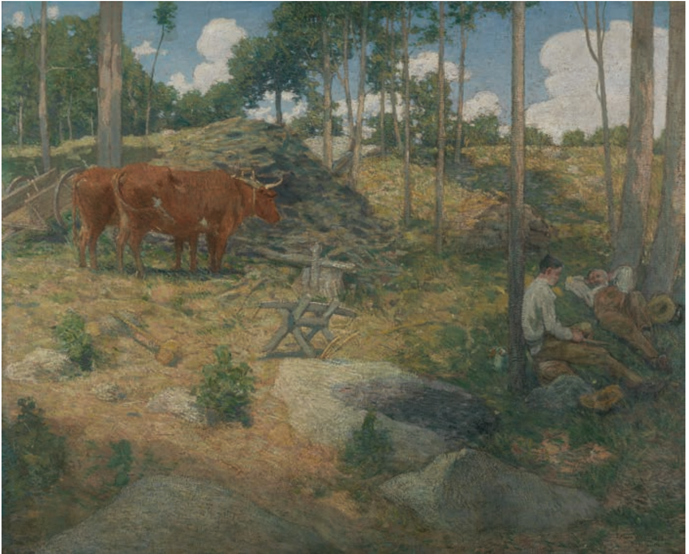
Figure 15. Julian Alden Weir, Midday Rest in New England , 1897.

Oil on canvas, 39 \frac{5}{8} \times 50 \frac{3}{8} in.