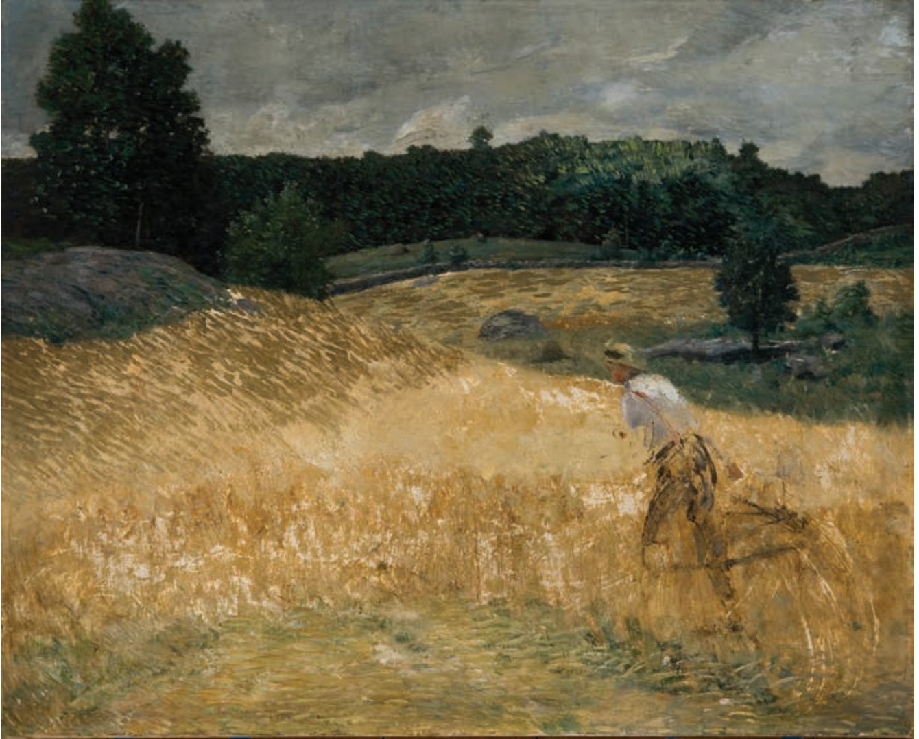
Figure 11. Julian Alden Weir, Connecticut Grainfield , c. 1895.