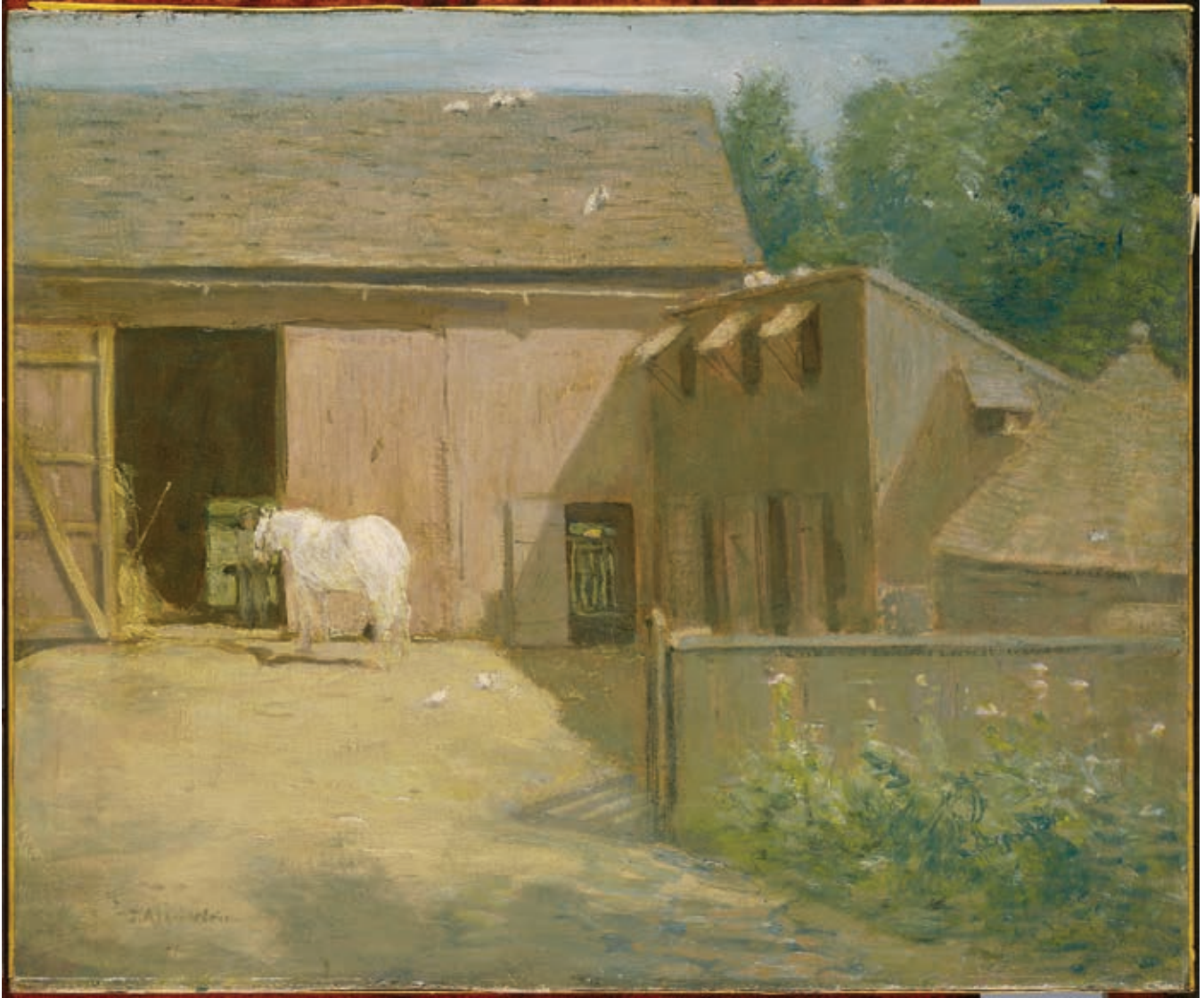
Figure 4. Julian Alden Weir, New England Barnyard , 1904.

Oil on canvas, 20 \frac{1}{8} \times 24 \frac{1}{2} in.