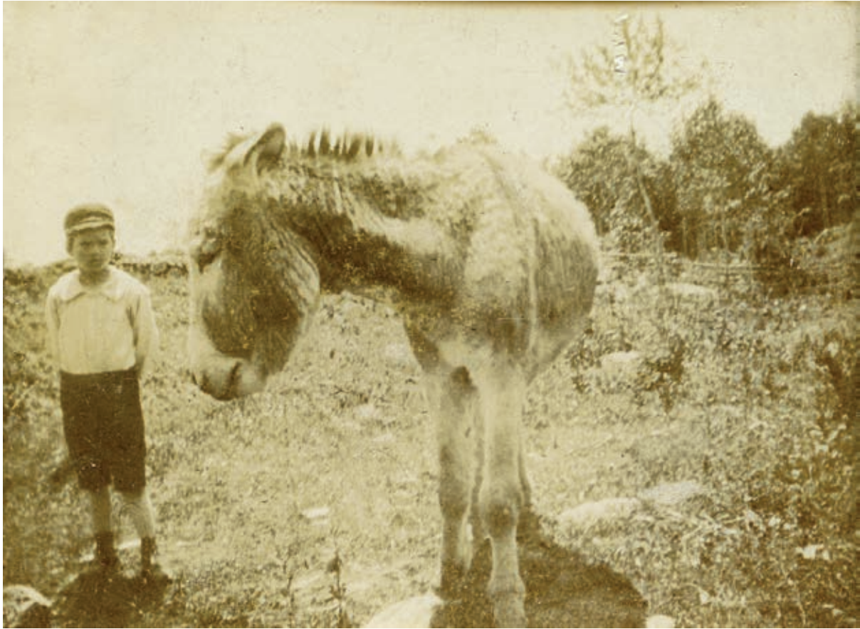
Figure 5. Tommy and Carl, WEFA 9447.