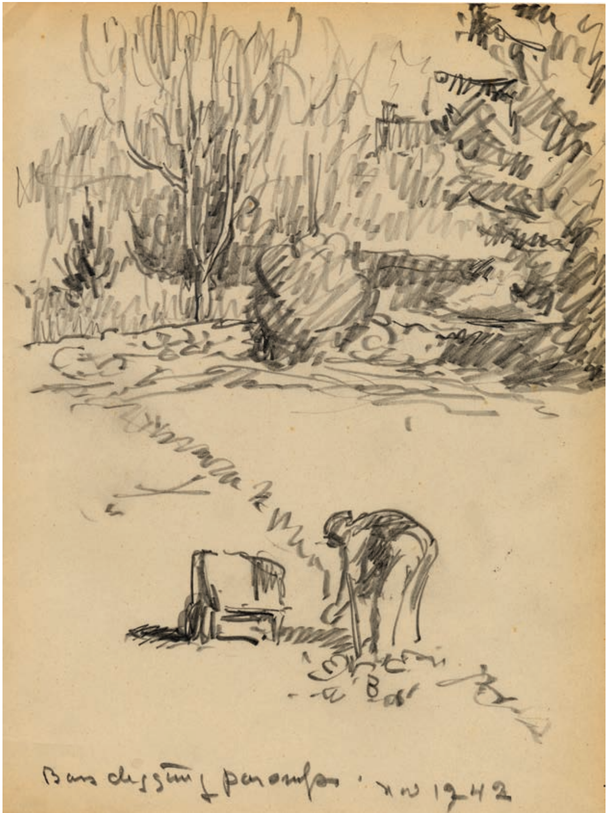
Figure 33. Mahonri M. Young, Bass Digging Parsnips , 1942, graphite, 10 \frac{3}{16} × 7 \frac{1}{16} in.

Brigham Young University Museum of Art, purchase/gift of Mahonri M. Young Estate, 1959.