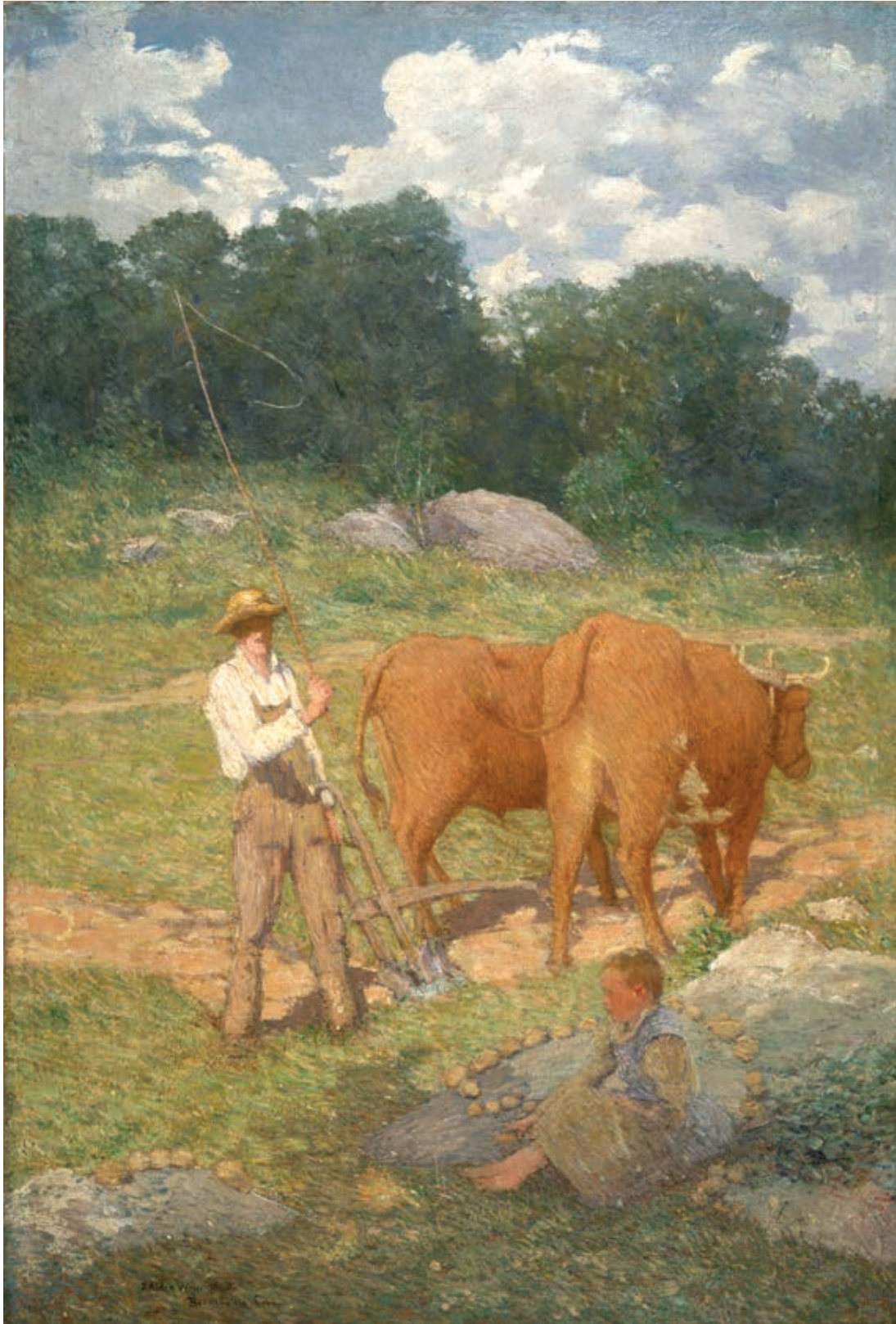
Figure 10. Julian Alden Weir, Ploughing for Buckwheat , 1898. Oil on canvas, 47 × 32 ½ in. Carnegie Museum of Art, Pittsburgh. Museum Purchase, 12.3.