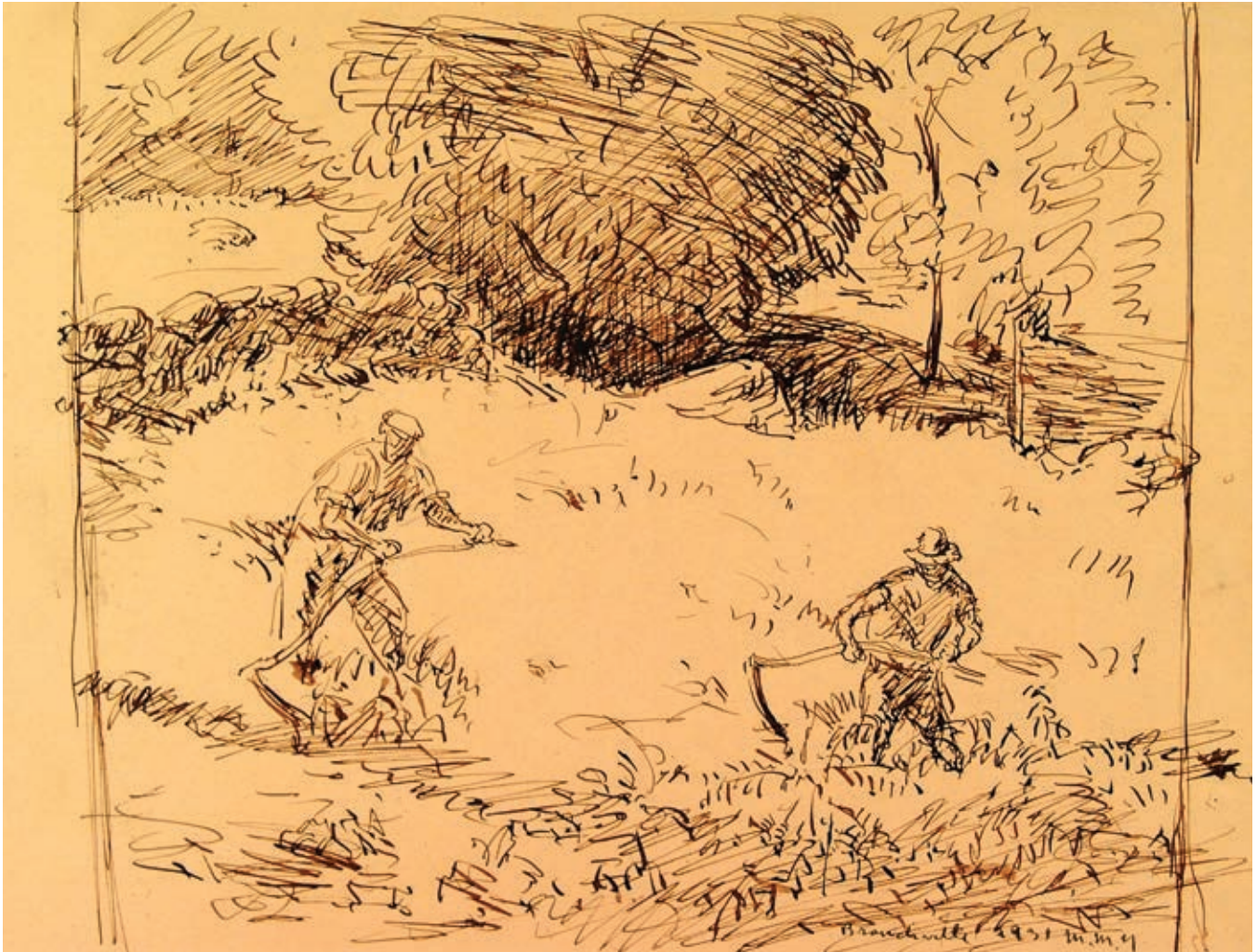
Figure 38. Mahonri M. Young, Scythe Cutters at Branchville , 1931, ink, 9 3 / 16 × 11 3 / 4 in.

Brigham Young University Museum of Art, purchase/gift of Mahonri M. Young Estate, 1959.