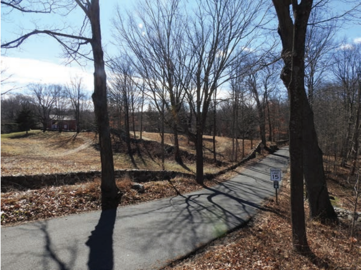
Figure 53. Great Wall of Cora, NPS Photo / A. Thibault.