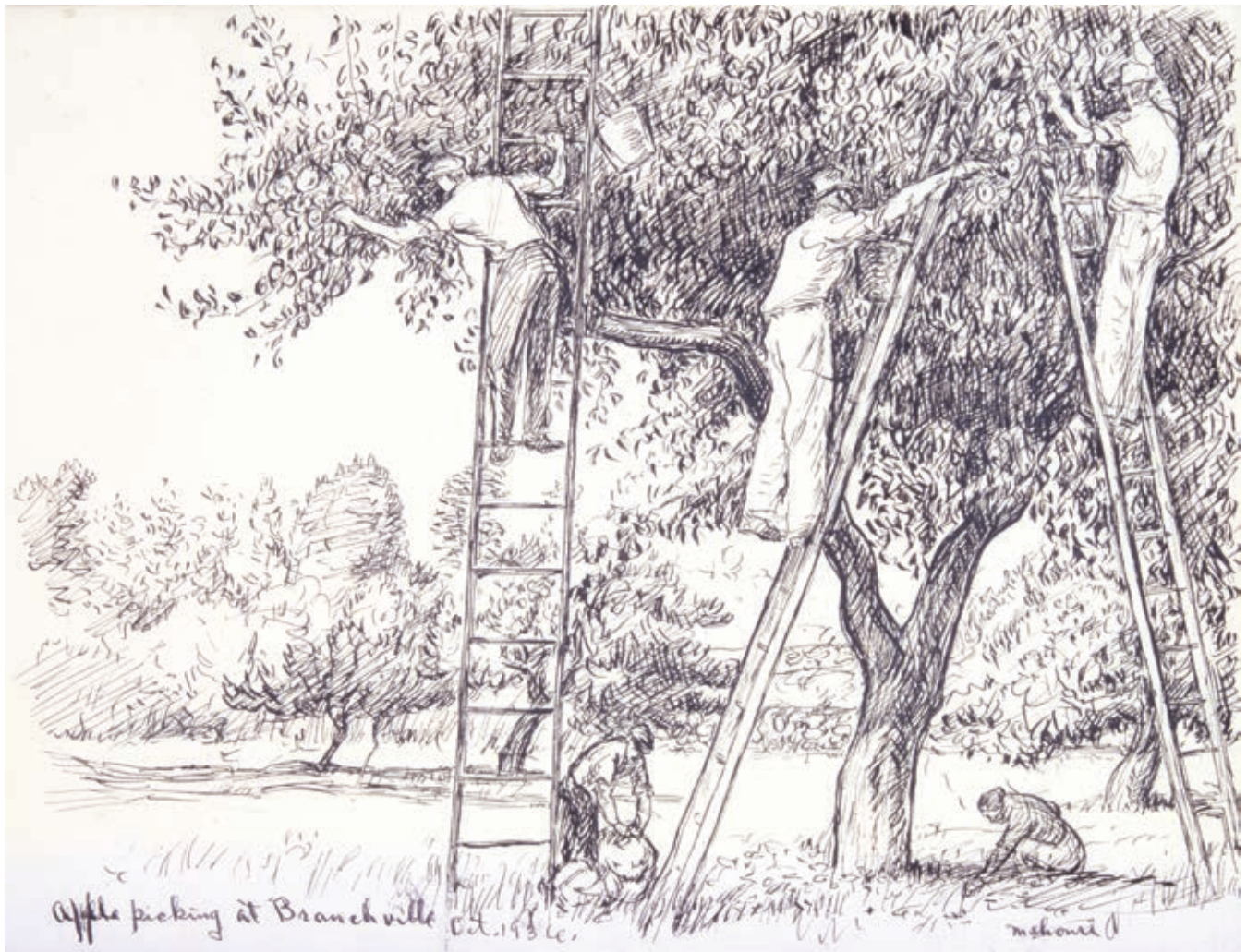
Figure 42. Mahonri M. Young, Apple Picking at Branchville , ink, 8 15 / 16 × 11 11 / 16 in.

Brigham Young University Museum of Art, purchase/gift of Mahonri M. Young Estate, 1959.