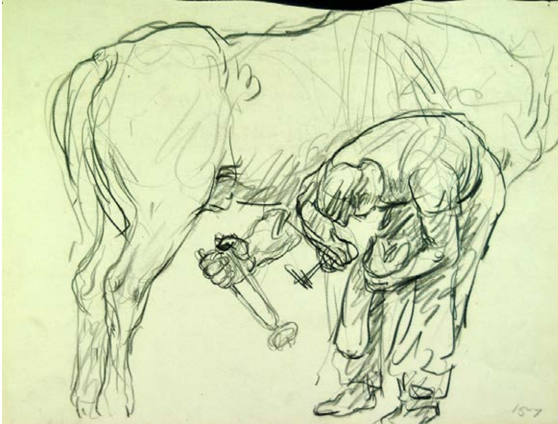
Figure 59. Mahonri M. Young, Blacksmith Shoeing a Horse , graphite and colored pencil, 7 11 / 16 × 10 1 / 8 in. Brigham Young University Museum of Art, purchase/gift of Mahonri M. Young Estate, 1959.