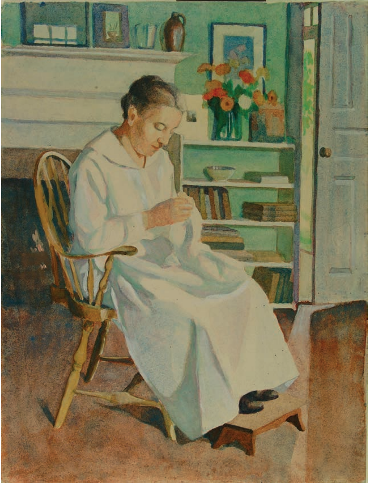
Figure 25. Dorothy Weir, Woman in Windsor Chair Sewing , c.1920, watercolor, 16 \frac{7}{16} \times 12 \frac{7}{16} in. Brigham Young University Museum of Art, purchase/gift of Mahonri M. Young Estate, 1959.