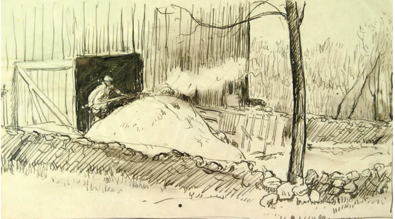
Figure 34. Mahonri M. Young, Bringing in the Hay , ink, 10 \frac{3}{16} \times 7 \frac{11}{16} in.

Brigham Young University Museum of Art, purchase/gift of Mahonri M. Young Estate, 1959.