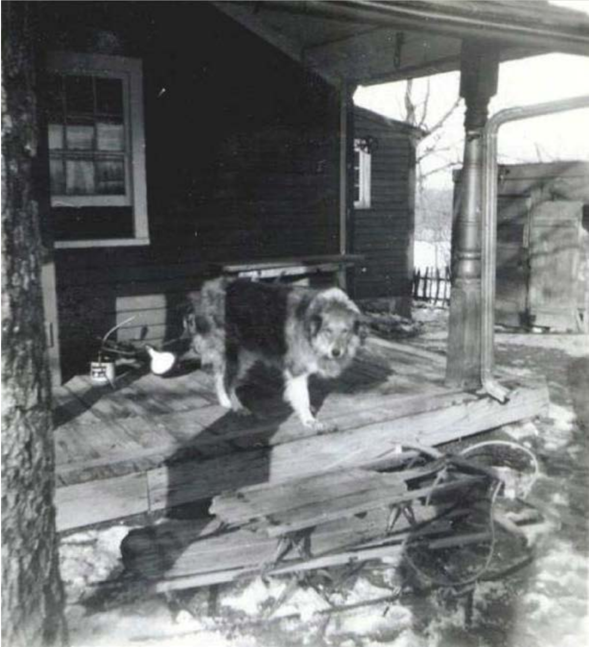
Figure 41. Dottie, the dog, on the porch of the caretaker's house. Woodshed visible to the right. Bass Family Photograph Collection, WEFA HP 01107.