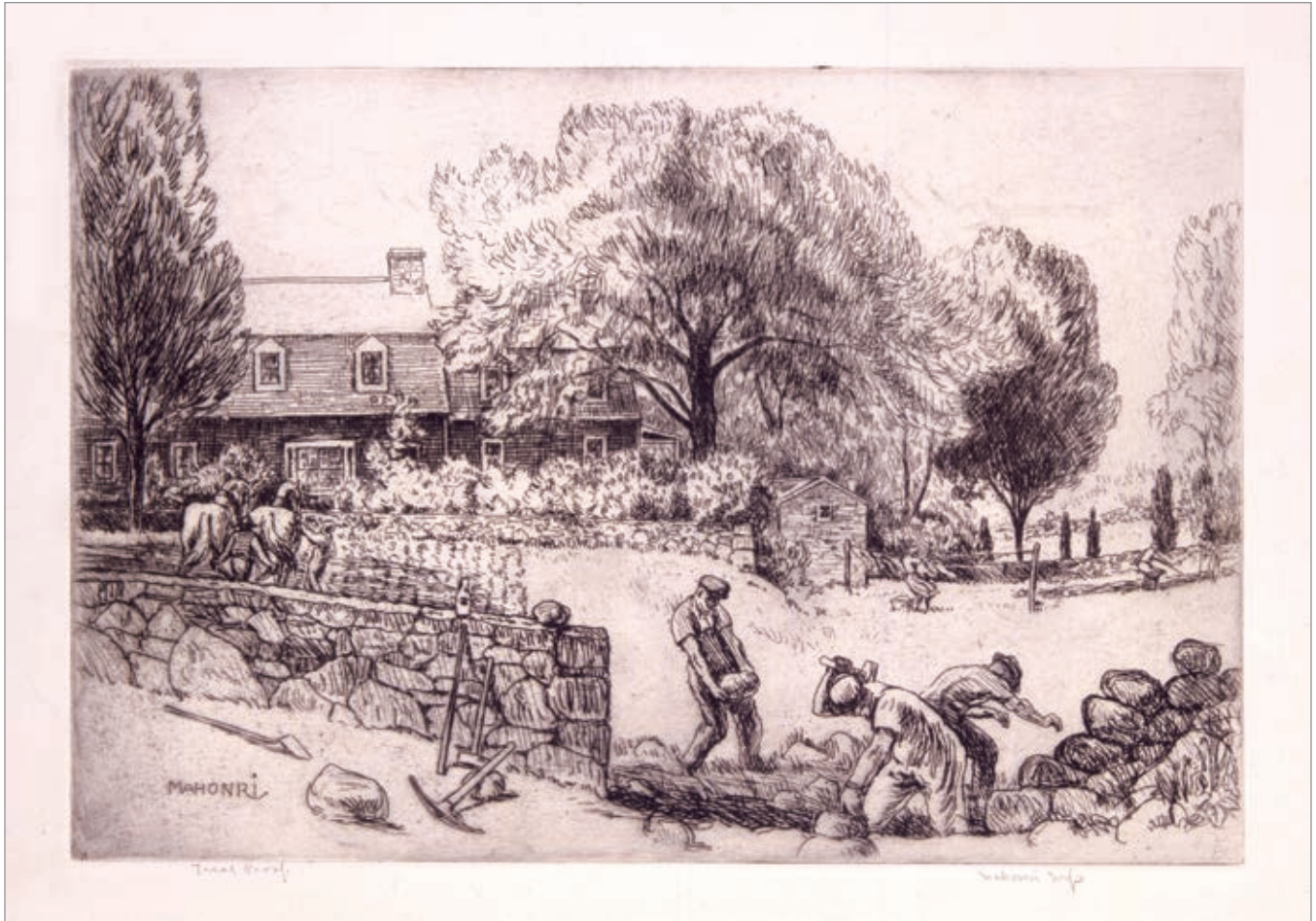
Figure 56. Mahonri M. Young, Joe Knoche Builds a New Stone Wall II , 1942, etching, 11 × 15 in. Brigham Young University Museum of Art, purchase/gift of Mahonri M. Young Estate, 1959.