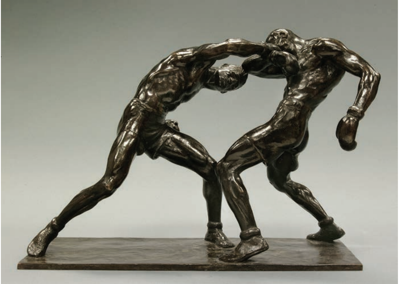
Figure 48. Mahonri Young, Right to the Jaw , 1926, bronze, 14 × 19 5 / 16 × 9 1 / 2 in. Brigham Young University Museum of Art, purchase/gift of Mahonri M. Young Estate, 1959.