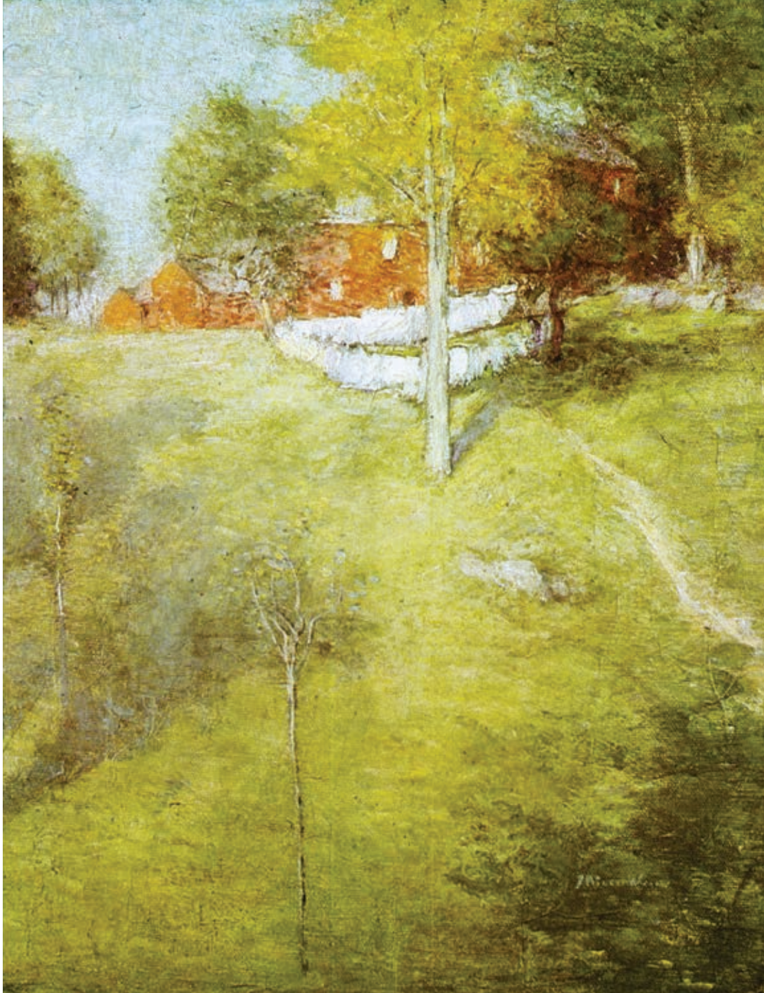
Figure 21. Julian Alden Weir, The Laundry, Branchville , oil on canvas, ca. 1894, 30 \frac{1}{8} \times 25 \frac{1}{4} in. Weir Farm Art Alliance.