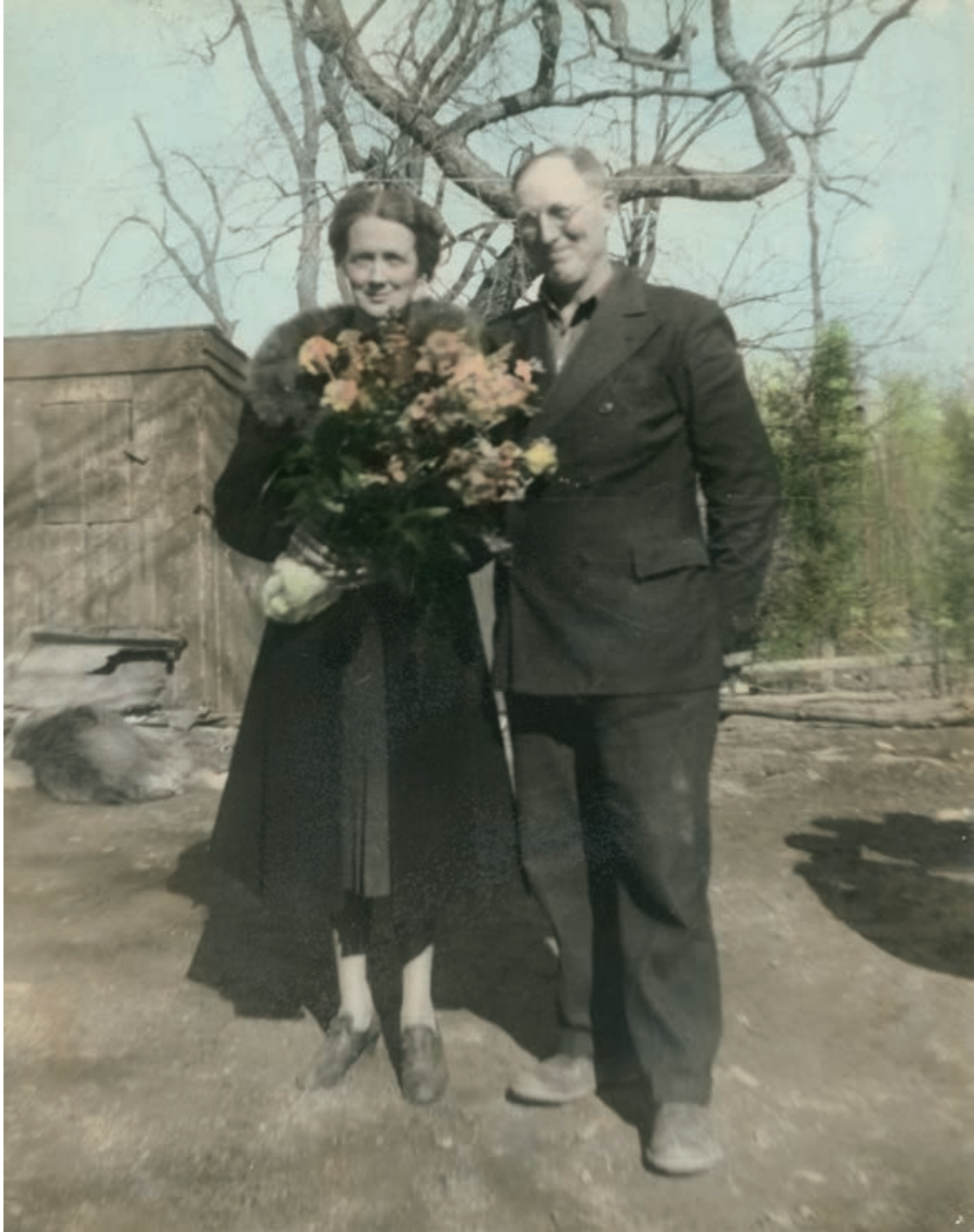
Figure 27. Mr. and Mrs. Bass on 30th Anniversary, 1940, Bass Family Photograph Collection, HP 01029.