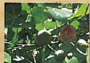
milo (hardwood tree)