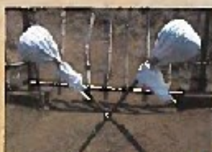
pālo'ulo'ulo (kapu sticks)