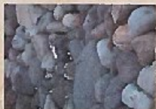
'aiā (water worn rocks)