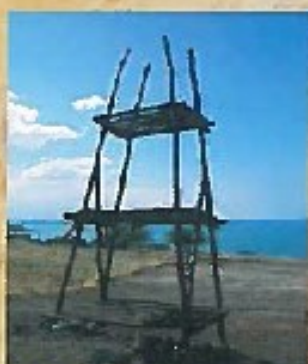
lala (offering tower)