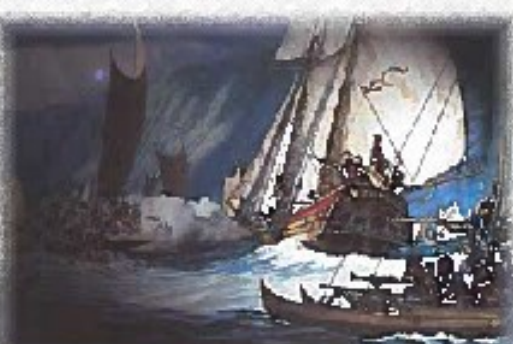
BATTLE OF "THE RED-MOUTHED GUN"

On the left is a timeline listing important events in Hawaiian history. Use the Park's Visitor Center exhibits, trail signs, and brochure to find the years that these events took place. The first date has been filled in for you!