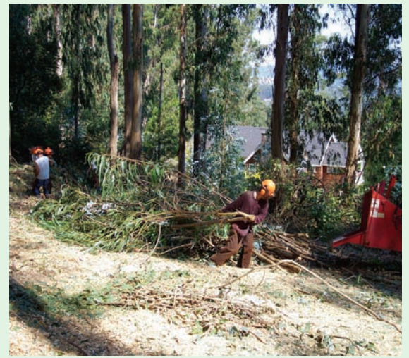
Above: Eucalyptus branches are hauled to a chipper during a fuel reduction project.

Below: Removing lower branches, also called limbing, increases fire safety. Clear a minimum of 10 feet off ground or 1/3 height of tree.