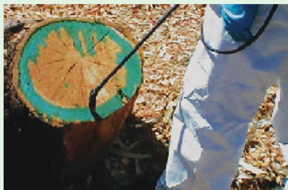
East Bay Regional Parks