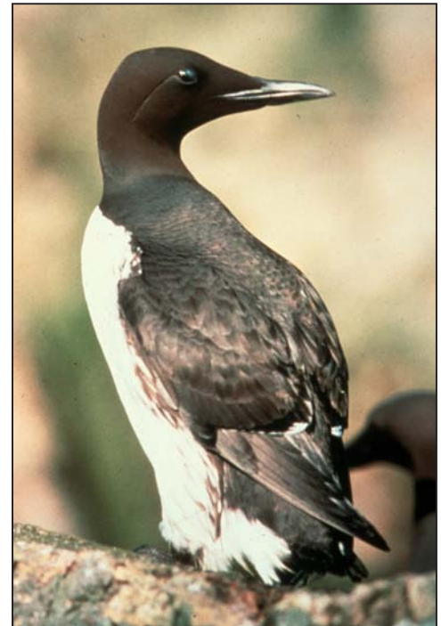
The Common Murre

Between 1996 and 2005, project biologists used social attraction methods including decoys, sound systems, and mirrors to encourage murres to re-colonize Devil's Slide Rock. To determine the effectiveness of the social attraction techniques and to assess other restoration needs, other nearshore murre colonies have also been monitored. In Point Reyes National Seashore, intensive monitoring has been conducted at Point Reyes Headlands with additional monitoring at colonies in Drakes Bay, including Point Resistance, Millers Point Rocks, and Double Point Rocks (Stormy Stack). In addition, the Castle/Hurricane Colony Complex in Monterey County has also been studied.