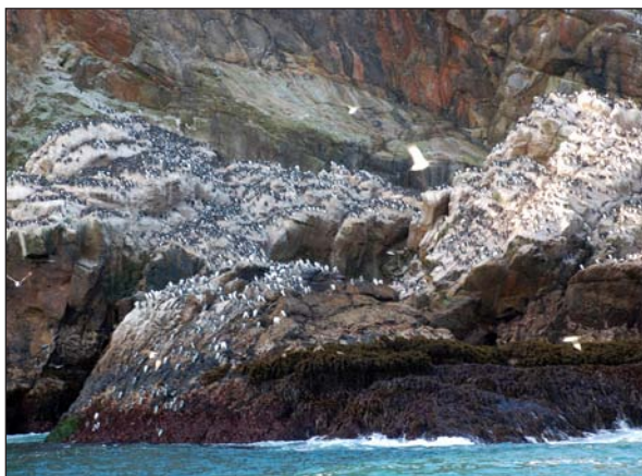
Lighthouse Rock at the Point Reyes Headlands

Project biologists use a combination of traditional methods and new technologies to monitor the murres and other seabirds. In traditional land-based monitoring, biologists use high powered spotting scopes and binoculars to determine daily and seasonal attendance patterns, record productivity, and census a variety of seabirds in addition to murres, including Brandt's ( Phalacrocorax penicillatus ) and Pelagic ( P. pelagicus ) Cormorants, Western Gulls ( Larus occidentalis ), Black Oystercatchers ( Haematopus bachmani ), and Pigeon Guillemots ( Cepphus columba ). At Devil's Slide Rock, remote-controlled video cameras were mounted within the colony in 2005–07 to assist with monitoring and conduct additional studies. When operational, video was streamed live to the Internet and now recordings of this footage can be viewed through a link on the Common Murre Restoration Project website.