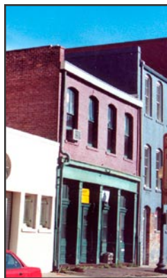
Left: Before rehabilitation the ground floor of the rear elevation was divided into four equal-sized bays.

The rehabilitation project proposed to return the upper floors to residential use. The first floor, which had little historic features or finishes remaining, was to be converted into an office in the front and parking in the rear. The rear of the building is a secondary elevation and using this portion for parking was determined to be compatible. Since no garage opening existed, the rear entrance had to be modified for vehicular access while retaining its historic character. One cast-iron pier was moved over several feet to create an opening wide enough for a car. Wood garage doors replicating the existing pedestrian doors were installed. Although moving the pier resulted in a slight change to the formerly symmetrical entrance, it did not negatively impact its historic character. The project met the Standards.