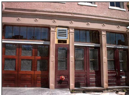
Left and Upper Right: The left bay was enlarged to create a vehicular opening which is compatible with the building's historic character.