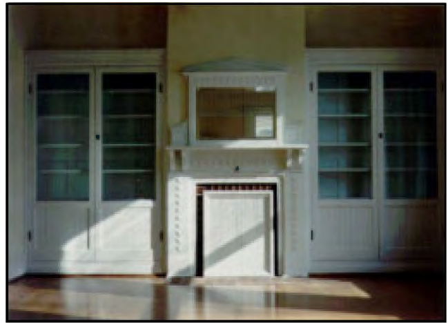
During rehabilitation most of the naturally-finished woodwork was painted white, resulting in a drastic change of character to this late-nineteenth century interior.