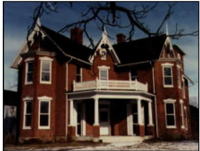
This late-nineteenth century Victorian Gothic-style house had survived for almost a century with only minimal changes to its interior and exterior.

Applying paint to traditionally unpainted interior surfaces can be as damaging to a building's historic character as removing paint from traditionally painted surfaces. For this reason, the Secretary of the Interior's Standards and Guidelines for Rehabilitation recommend against changing the appearance of historic features by applying new finishes to surfaces that have traditionally carried another type of finish.