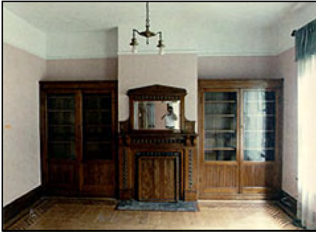
This view, taken before rehabilitation, shows the fine built-in cabinetry in one of the formal rooms on the first floor. Its natural color harmonizes with the designs of the parquet flooring.

As part of the rehabilitation all the previously unpainted wood trim throughout the house was painted white. Because the interior trim with its unpainted natural-colored finish was such an important historic feature of the house, painting it white resulted in a drastic change and loss of historic character. The extensive interior woodwork with the tone and grain of the natural finish had given a distinctive quality to the house, furthering the sense of time and place associated with the historic district. Painting of the woodwork lessened significantly the historic character of what had been a virtually intact late-nineteenth century house, and the rehabilitation does not meet the Secretary's Standards for Rehabilitation.