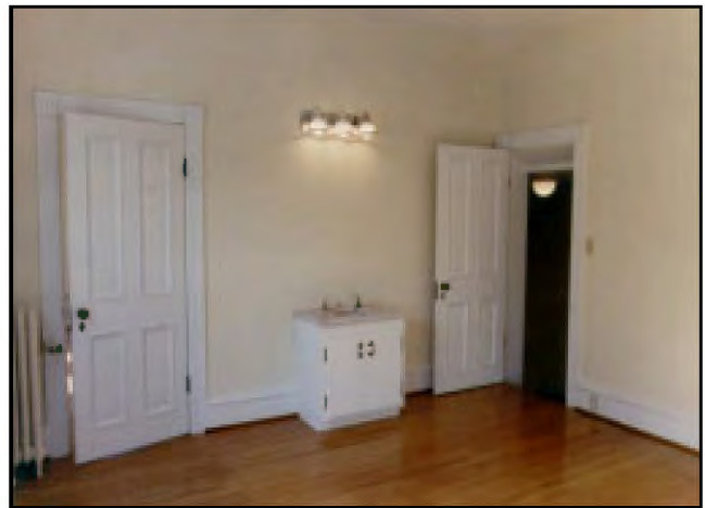
These "before and after" photographs of an original sink in an upstairs bedroom also show how dramatically the painted woodwork has changed the character of the room.