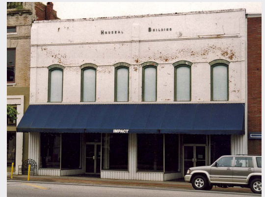
The photograph above shows the building described in the sample application prior to the rehabilitation work. Below left, the building is shown after its successful rehabilitation.