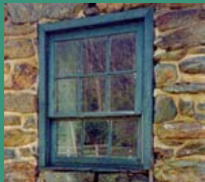
Photo 15, Pre-Rehab 206 Old Farm Road City, State

Label and number each photo and reference it in the application. If plans are provided, key the picture to a floor plan with an arrow indicating the direction in which it was taken.