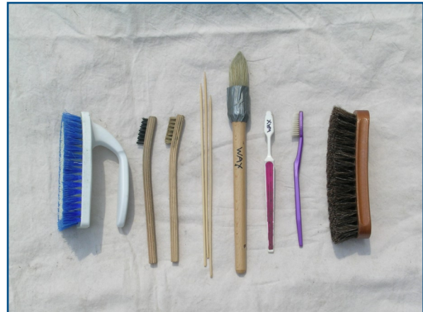
Materials used for cleaning and waxing: scrub brushes, bamboo skewers, waxing brush, toothbrushes for buffing, and horsehair shoe polishing brush.