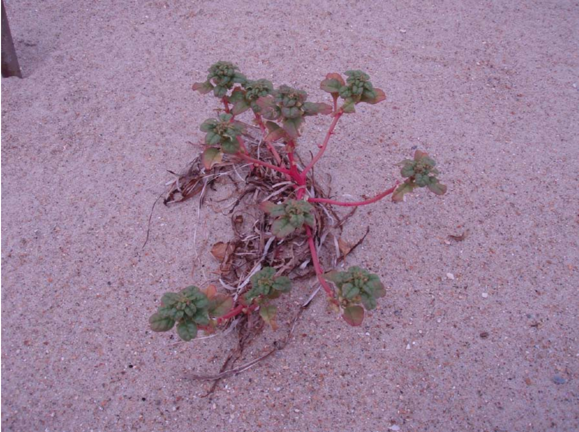
Seabeach amaranth plant on soundside shoreline of Cape Lookout Bight.