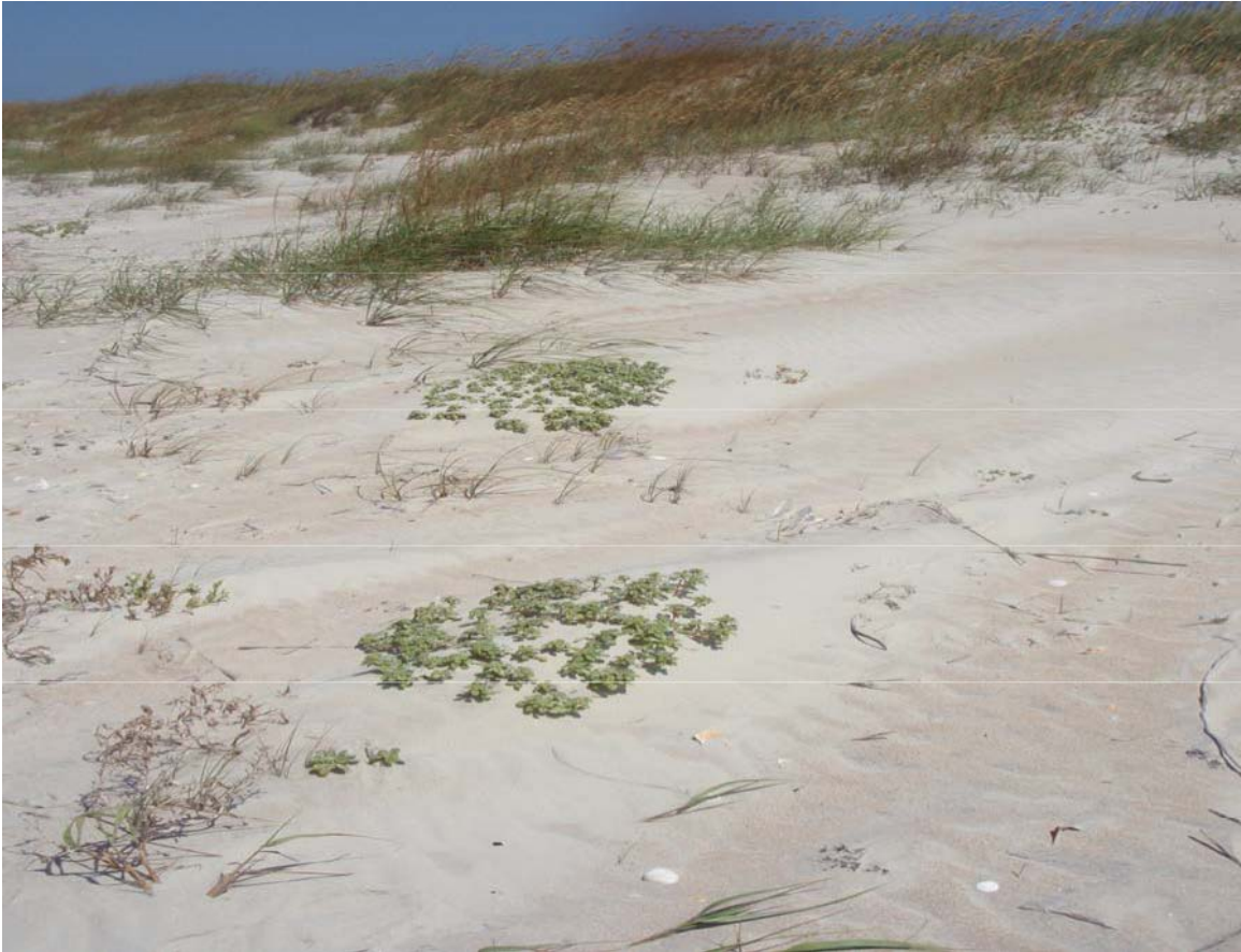
Seabeach Amaranth plants building dunes on Shackleford Banks.