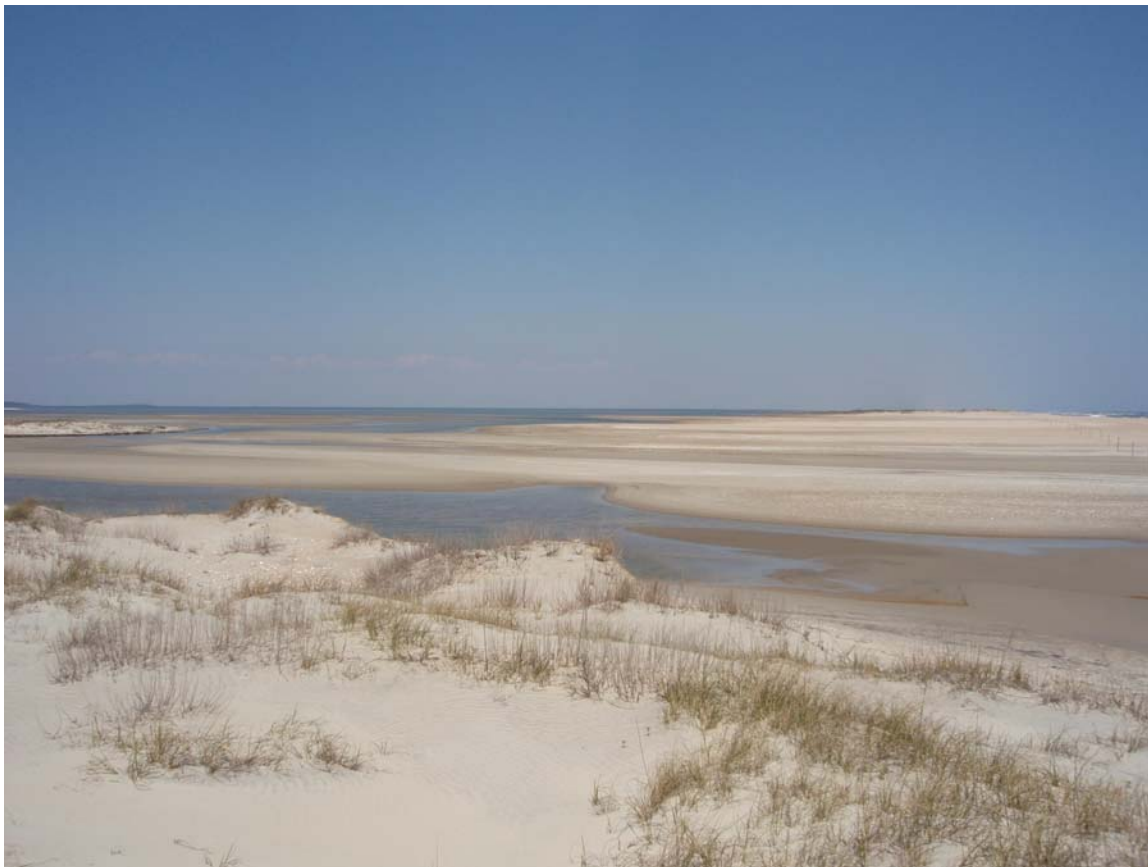
Old Drum Inlet filled in naturally in March 2009.