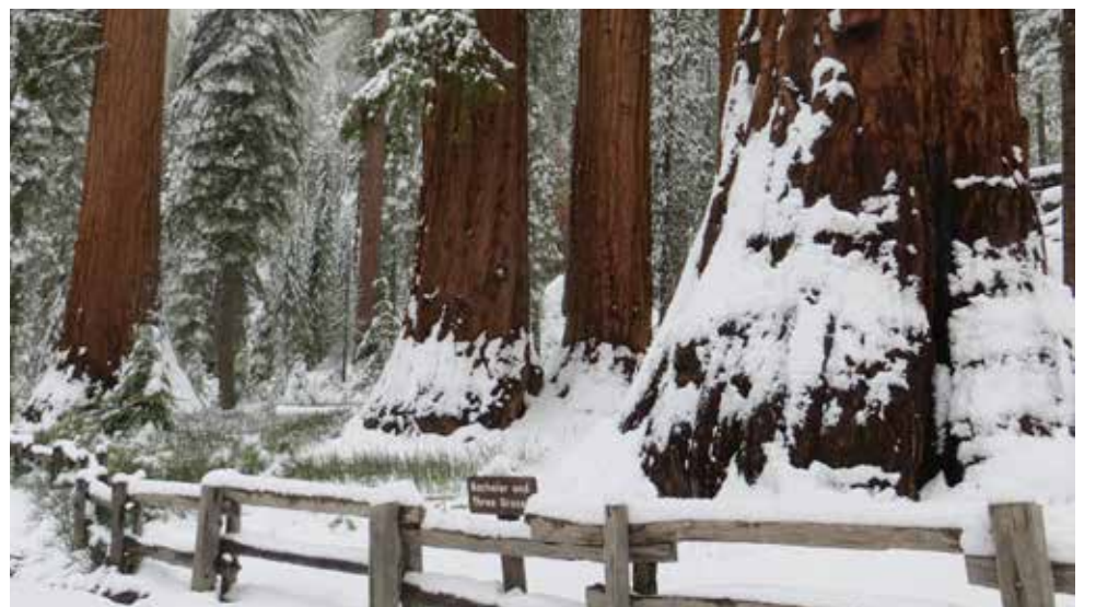
Snow at Wawona's covered bridge.