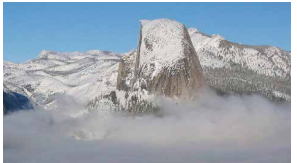
The view from Glacier Point.