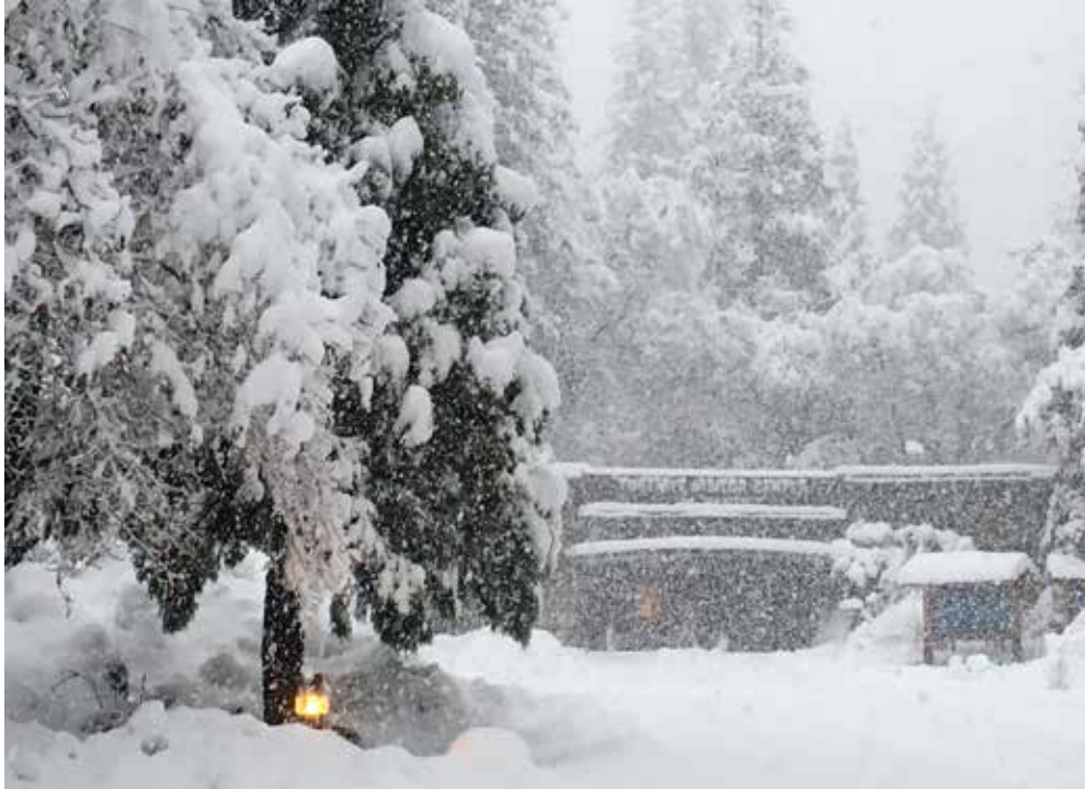
Yosemite Valley Visitor Center in a snowstorm.