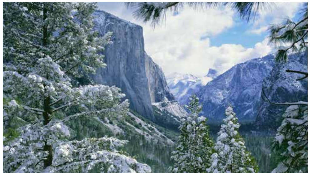
Yosemite Valley in Winter.