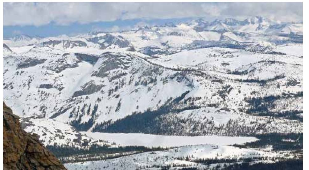
Tenaya Lake.