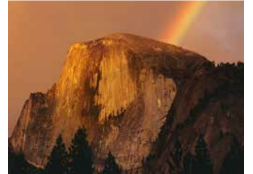
Half Dome, Christine White Loberg

This publication was made possible by the Yosemite Park Partners listed on this page. Read more below or visit www.yosemitepartners.org to learn more about helping these organizations provide for the future of Yosemite National Park.