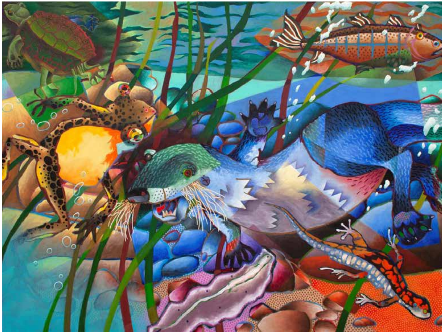
Trowzers Akimbo, The Otters are Back , Oil Painting, Yosemite Renaissance 34