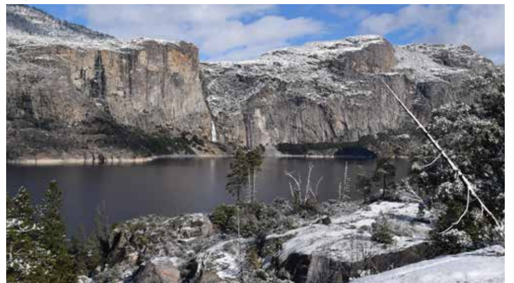
Hetch Hetchy Reservoir.