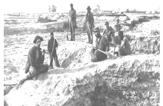
Soldiers constructing earthworks during the war

The men on the front lines found they could improve their chances for success, and more importantly, for survival, by digging in. Simple rifle pits could be dug by infantry soldiers in earnest, even under fire. These crude pits could be improved to form trenches with headlogs and ditches in front.