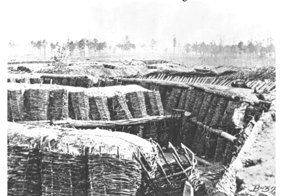
Use of gabions and fascines

battles, and occupation of Corinth. Yet, with just a little imagination, one can envision how things would have appeared to those soldiers building, manning, and fighting in these works during the Civil War.