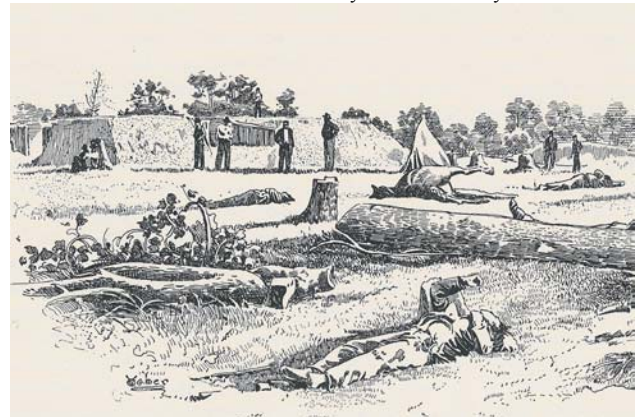
Battery Robinett shortly after the battle

During the Battle of Corinth, the fight for Robinett was bloody and desperate. A Confederate attack against the bastion resulted in a hand to hand struggle for the position. The strength of Federal defensive fortifications proved effective against the Confederate assaults.