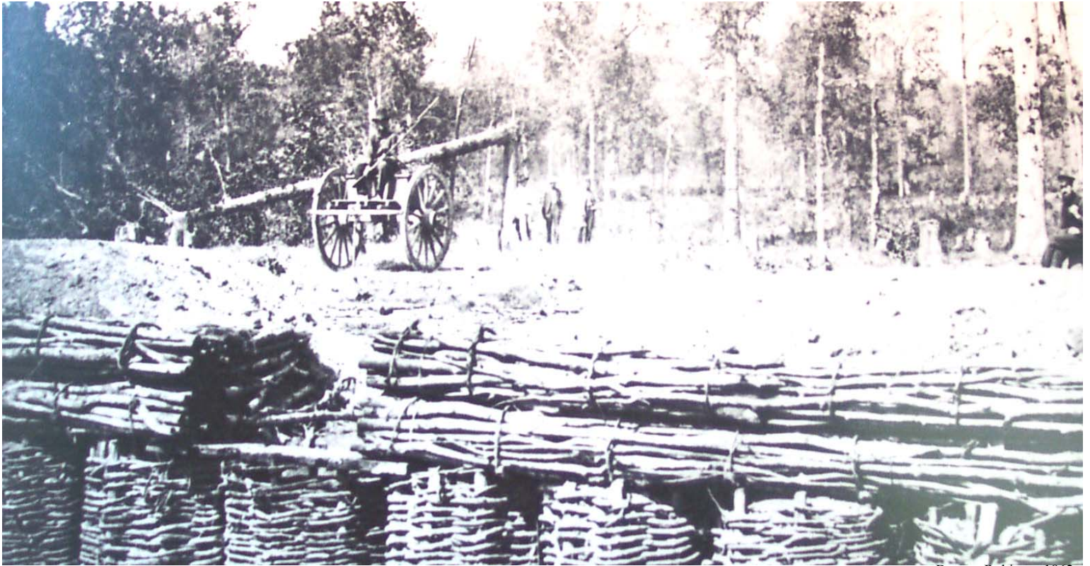
Battery Robinett, 1862