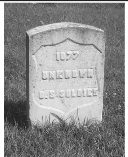
Unknown U.S. Soldier

National cemeteries and soldier plots are special places, and Shiloh is no different. Buried with these American soldiers is the honor, courage, and sacrifice of an entire American generation. Indeed, these soldiers gave the ultimate sacrifice for what they believed in. Can we of today’s generation learn from these soldiers and meet our own challenges and problems with the same dedication they possessed? Despite different means to wage war, different enemies to face, and different objectives to win, we are still fighting for the same causes they were: life, liberty, and the pursuit of happiness. Perhaps President Lincoln said it best when he declared “that these dead shall not have died in vain,” but that this nation “shall not perish from the earth.” It is our duty to take the standard and make sure Lincoln’s vision is never lost.