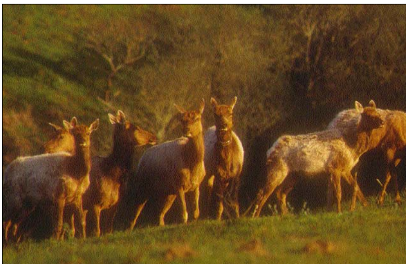
Tule elk ( Cervus elaphus nanodes ) is a subspecies of elk native to California. In 1978 tule elk were restored to Point Reyes National Seashore after being absent from the area for over 100 years.

Information on tule elk reproductive and mortality rates is critical to accurately understand the underlying factors influencing the population dynamics of this species. Radio-marking is currently the most effective method of monitoring individual animals in a free-ranging situation to determine population parameters. Radio telemetry collars were fitted onto adult female elk. Blood was taken at capture to determine pregnancy status. Radio collared elk were monitored regularly to determine their locations and survival rates. Fecal samples from collared elk have been biannually tested for Johne's disease, an exotic diarrheal wasting disease previously identified in the elk population. A sample of tule elk calves were fitted with radio telemetry collars and monitored for the first year of their lives to determine neonatal and calf survival rates.